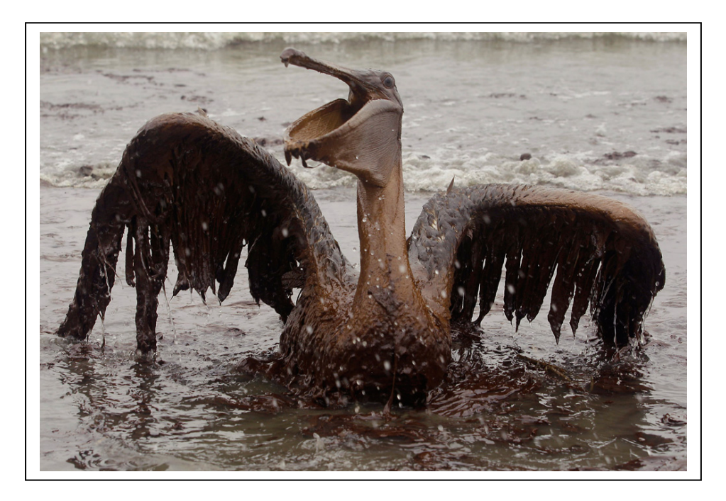
Figure 2. A Brown Pelican coated in oil on the beach at East Grand Terre Island, Louisiana AP Photo by Charlie Riedel 2010.

Many vulnerable species have been identified, including oysters, shrimps, blue crab, finfish, blue-fin tuna and dolphins. Pelicans were also affected by oil spill as their feathers become coated in oil when they plunge into water (Figure 2). This limits their ability to fly, and lessens their ability to regulate their body heat.