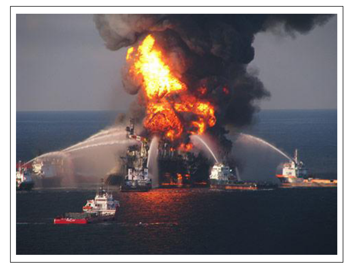
Figure 1. Explosion of Oil Rig (Burning Deep Water Horizon)