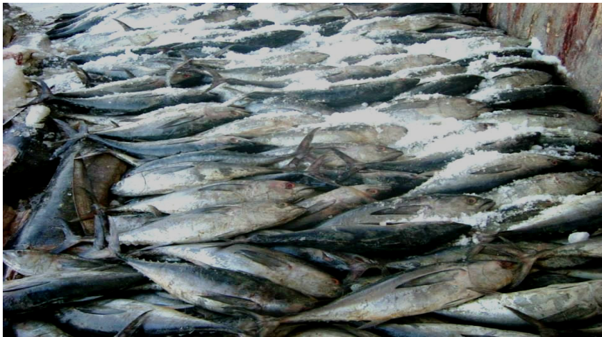
Figure 2. Collection of Thunnus tonggol at Fish Harbour

The muscle, liver, kidney, gills and gonads tissues of the fish were prepared for analysis according to the method described by Bernhard (1976). Approximately 5 g dorsal muscles, entire liver, 2 rakers of gills, entire kidney, and entire gonads were prepared separately from individual fish which were then cut into small pieces and homogenized. The samples were then placed in a muffle furnace and the temperature was gradually increased to 500°C over a period of 3 hours to avoid a loss of material due to sudden combustion. The samples remained in the muffle furnace for 72 hours until they had been reduced to a grey to white ash. The ashes were dissolved with 10 millilitres of 0.1 M HCl according to the method of Gutierrez et al. (1978).