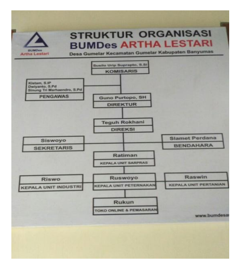
Figure 1. Organizational Structure BUMDes Artha Lestari Gumelar