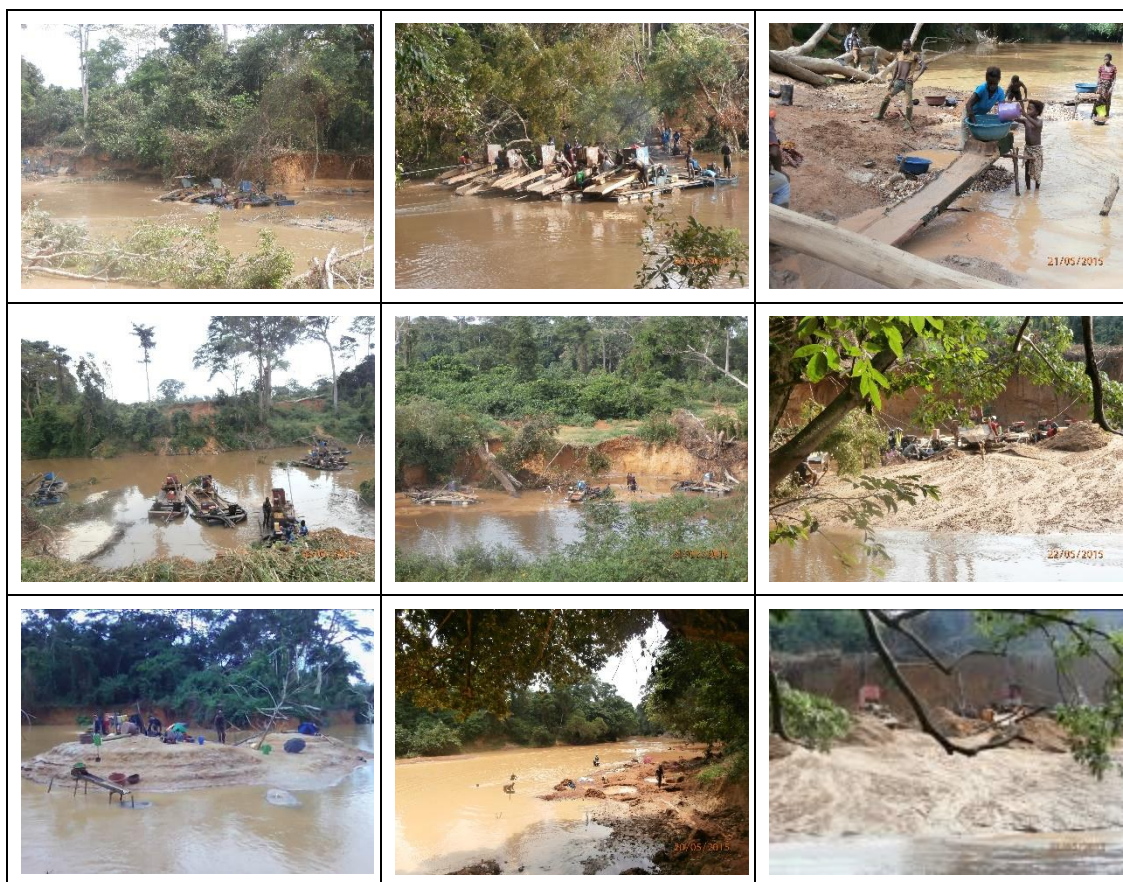
Figure 3. Overview of illegal gold mining activities on the Cavally River and their impacts on the watercourse.

Sections of the Cavally river suffers from strong anthropogenic pressure mostly related to gold mining. This intensive gold mining activity by using motorized equipment in the river bed has led to water pollution, destabilization of riverbanks, destruction of the forest gallery, disruption of ecosystem functioning, modification of the substrate, high noise levels and high concentration of suspended solids. Konan et al. (2015) and Kouassi et al. (2017) point out that the habitats located in the Zouan-hounien area are particularly threatened by these anarchic gold panning activities. The strong anthropogenic pressure in this sector of the river causes the loss of habitats, in particular for Micralestes eburneensis which is endemic to this hydrosystem (Figure 3). Overharvest is also a major threat to the species given its importance as a food fish (Konan, 2015; Konan et al. , 2015).