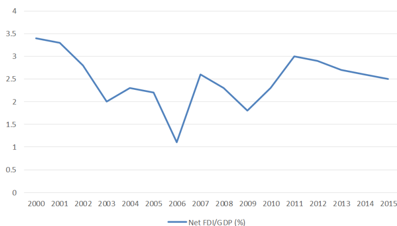
Figure 2. Net FDI Flows as a Percentage of Latin America's Gross Domestic Product

The importance of these net inflows is better appreciated by focusing on their recent evolution relative to GDP and the gross fixed capital formation of the major countries of the region, given FDI's important role in financing private capital formation. Figure 2 below show that net FDI inflows as a proportion of the region's GDP were quite significant during the 2000-2015 period. For example, with the exception of the years 2006 and 2009, these net flows have represented at least 2 percent of the region's GDP, and during 2010-15 they averaged an impressive 2.7 percent (with some years at or close to 3 percent of regional GDP).