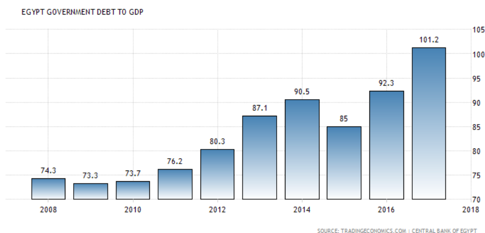
Figure 1. Development of the government debt to GDP ratio from 2008 until 2017