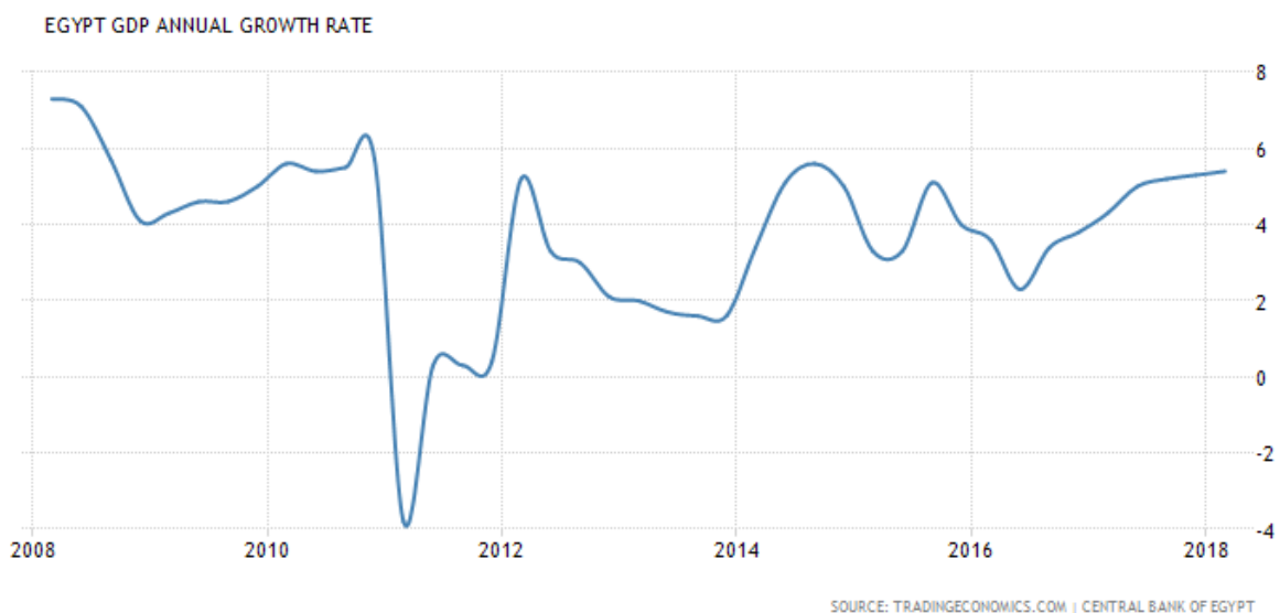
Figure 3. The Egyptian annual growth rate from 2008 to 2018

As shown in Figure 2, Egypt had a government budget deficit equal to 9.50% of the country's Gross Domestic Product in 2017. The average budget deficit from 2002 until 2017 was -9.72% of GDP.