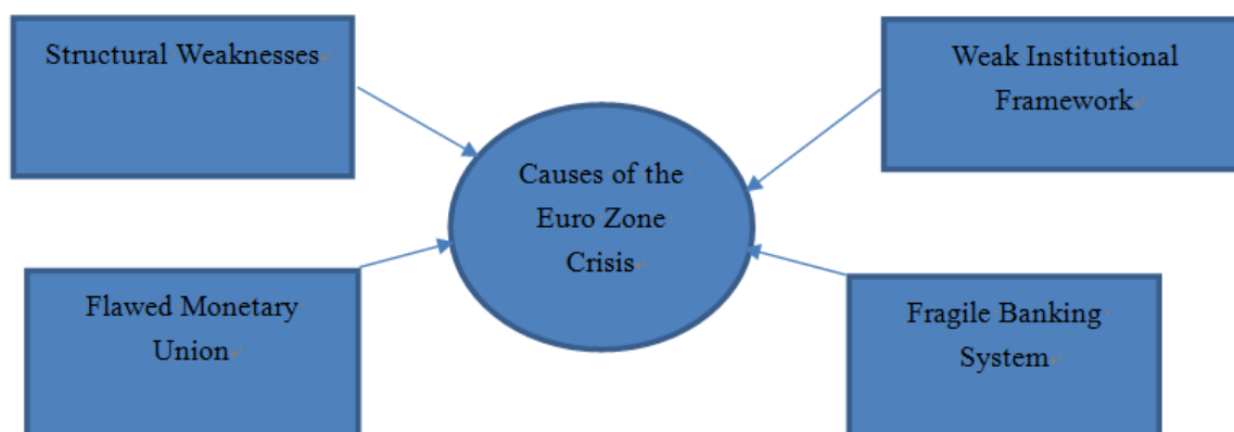
Figure 1. Causes of the Euro Zone Economic Crisis. Author's Construct.

The euro zone crisis can be rooted back to four main reasons. First, as Feldstein (2012) argued, the monetary union per se, with the restrictions that it imposes, embeds its own reasons for unavoidable failure; second, the weak institutional framework of the euro zone as spelled out in the Maastricht treaty establishing the currency union; third, the fragile European banking system which indulged itself in huge lending to European governments bringing the whole zone into a vicious cycle and; fourth, structural weaknesses existing in a number of euro zone economies. Similarly, the crisis in Europe reflects primarily the reaction of financial markets to over-borrowing by private households, the financial sector and government in periphery countries of the euro zone (Weidmann, 2012). Proponents of this view argue that if countries had balanced their budgets and avoided the temptation to create a welfare state, excessive private spending would not have occurred and investors and banks would have been more aware of the risks involved (Wolf, 2012).