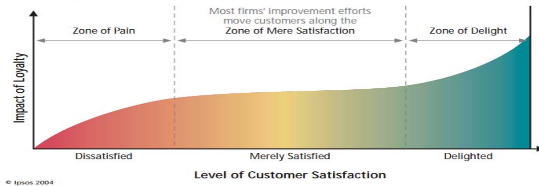
Figure 1. Delight Curve