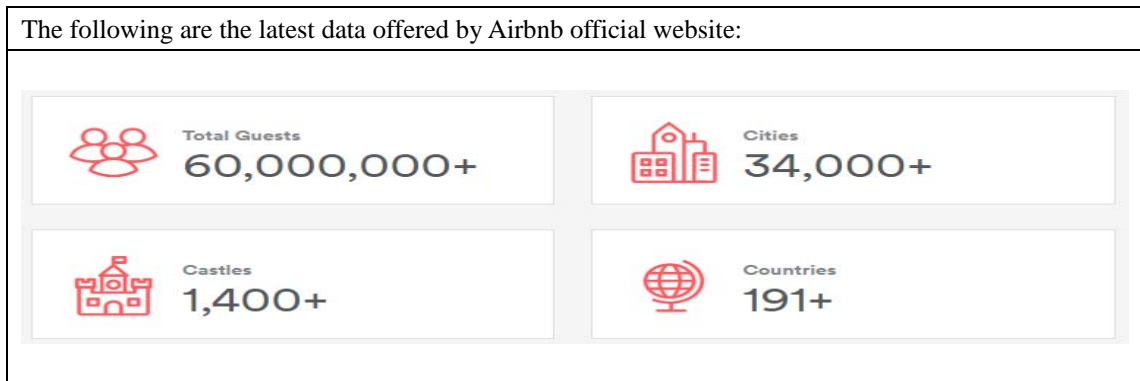
Table 1. Airbnb