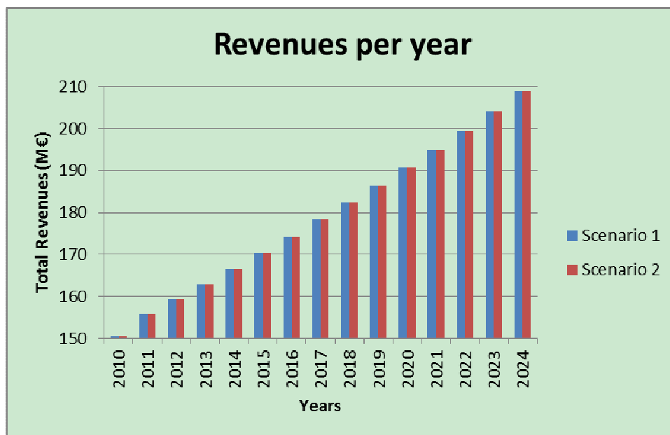
Figure 2. Revenues per year for scenario 1 and scenario 2