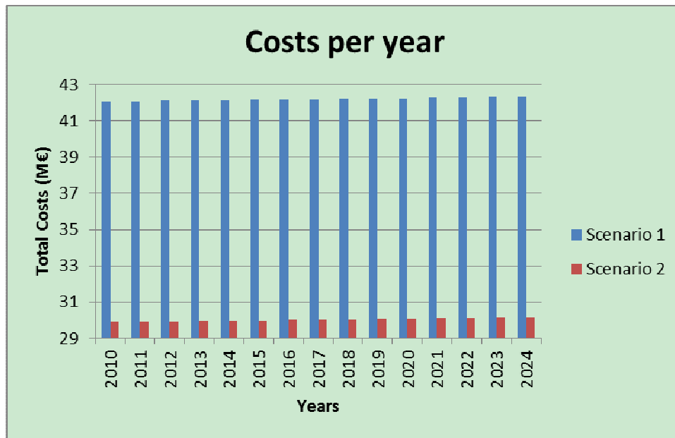
Figure 1. Total costs per year for scenario 1 and scenario 2