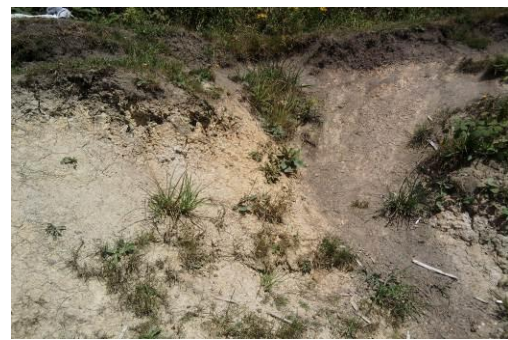
Figure 14. L5b. An area of the exposed rock (mudstone)