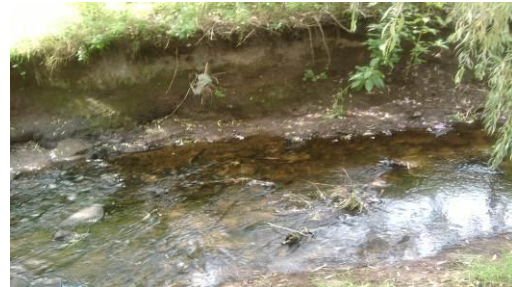
Figure 3. L1b. Observed Lithology at the South of Brook