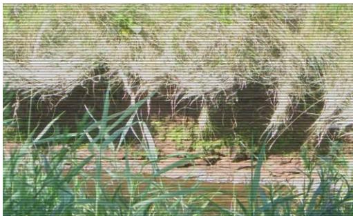
Figure 5. L2b. A small area of good exposure showing the bedding plane (Source: Ayeni et al., 2011).

The site is located at Kirkby and to the North of Knowsley. It is about the North end of the Kirkby Brook (L1) and the area is commonly known as Tower Hill. The location is generally a sedimentary terrain with a stream section of active flow and small exposures of geologic features of interest. The observed structure is made up of exposed bedding planes, parallel bedding, and mud clasts with bioturbation. The location is mainly of sandstone and colour ranging from brownish to red and it is of Triassic age. The whole section of the brook is covered by vegetation except some small areas in which the rock exposures are observable.