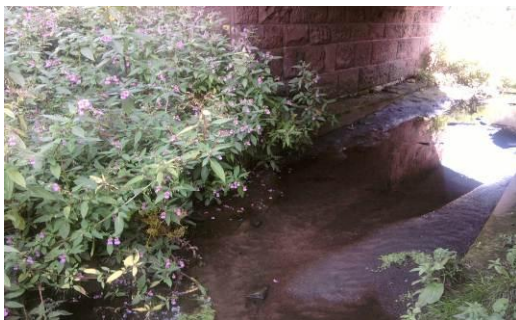
Figure 7. L3a. Section of the site showing recent sand deposition

The site is of sedimentary origin with a stream and sediment deposition along its course. The stream flows from North of the area through a Willow tree plantation to the industrial area where there is limited access. The topography presents high steep sides and covered by vegetation and weeds which obscure the whole exposure and this is an evidence of poor management. The site is composed of sand and sandstone based on the small exposure in some areas with colour ranging from brownish to dark brown. No clear texture was observed but small bedding planes were seen.