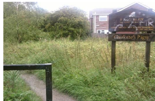
Figure 19. L6d. Accessible footpath covered by vegetation (Source: Ayeni et al., 2011).