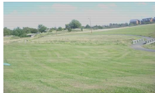
Figure 6. L2c. A general overview of the area