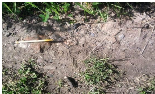
Figure 15. L5c. An area showing buried pebbles