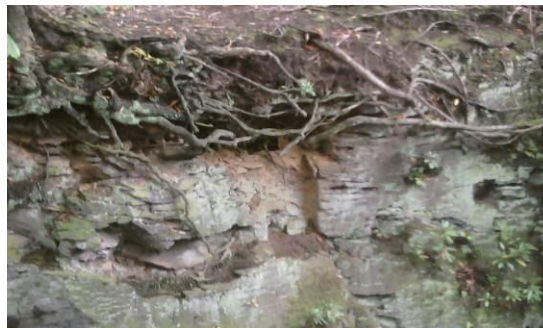
Figure 12. L4c. Weathered surface exhibiting parallel bedding and partly covered by tree roots