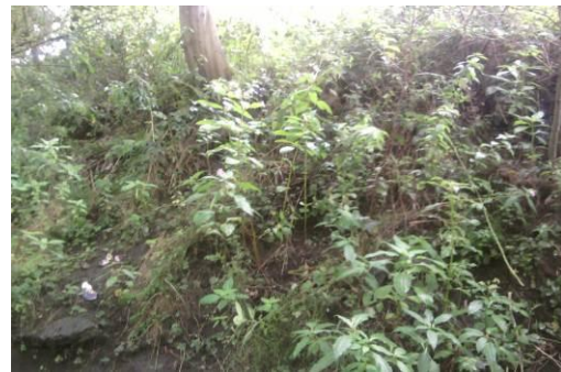
Figure 17. L6b. Stream banks covered by vegetation