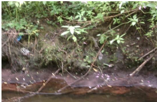
Figure 18. L6c. Section of the exposure feature showing the lithology