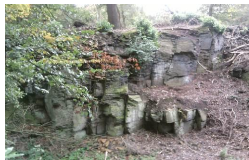
Figure 11. L4b. Exposed surface covered by dead leaves