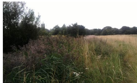
Figure 8. L3b. A long stretch of the site with overgrown vegetation