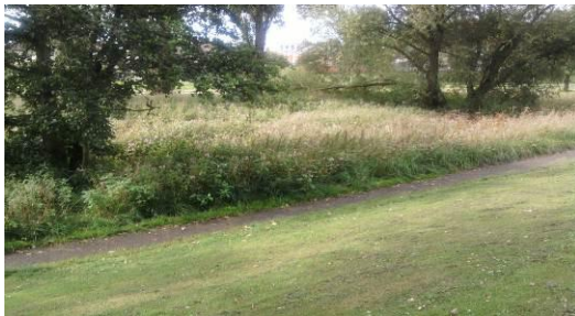
Figure 2. L1a. Brook covered by vegetation

This site is a little brook located at Kirkby which is accessible to the public. It is an open water course with lithology of sand and gravel. Exposures are of parallel bedding planes with varying lithology along the stream course. Also identified are carbonaceous materials and mud deposits, pebbles and boulders. The lithology is sandstone of Quaternary period (recent) with colour ranging from white to dark-brown. The texture of grain varies in sizes from very fine to coarse and visible mineral constituents are quartz and feldspar group. No visible structural displacement or tectonic activities are evident. Exposed features are covered by plants, trees and algae.