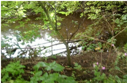
Figure 16. L6a. Section of the stream covered by shrubs and sand deposit along its bank

The location is a stream floodplain with active streamflow from East to West of the area. The geology is of sedimentary origin which has a lithology of sandstone, probably of the Carboniferous age. Steep rocks surfaces exposed on both sides of the stream along the stream channel; obscured with vegetation, plant roots and trees. The visible and accessible part of the exposure is the other side of the stream which shows the sedimentary structure of distinct parallel bedding plane while it is dark brown in colour.