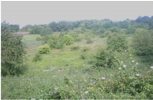
Figure 13. L5a. Site covered with vegetation

The site is a huge landmass which spans Whiston and Huyton. The park is divided into four quadrants and each differs in character and in particular, for the purpose of this research; Quadrant 4 was surveyed which is a large area of biotic nature (grassland and woodland) and consist of mudstone of carboniferous age. The outcrop belongs to the Lower Coal Measure. Sedimentary structure such as concretions was documented.