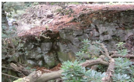
Figure 10. L4a. Rock surface showing parallel bedding covered by lichen

This site has exposures of large brownish, fine to medium grains of sandstone ridge with some mafic minerals and it is Quaternary in age. The exposure is partly covered by green lichen, tree roots and vegetation, the surface exhibits some structures; such as, faults with joints and the outcrop displays a tilting large scale of parallel bedding and natural landform is hilly.