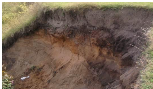
Figure 4. L1c. A massive eroded surface showing the Lithology at the South-end