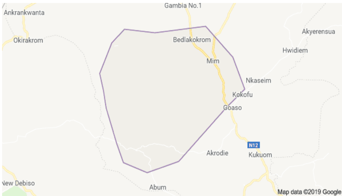
Figure 1. Asunafo North District- Location of the study