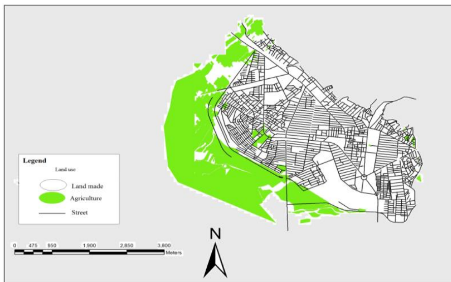
Figure 2. The exploitation of urban land (authors, 2013)

The exploitation of urban land means that with regard to the being expensive, scarce and non-renewable as well as lack of the possibility of urban land imports, these lands are used by few people. The origin of Yasuj was on the agricultural lands and it is continuing its development on this desirable land day by day, and has caused missing the agricultural boom in the area. As seen in Figure 2, the sprawl development of the city is progressing towards agricultural lands. Thus, the exploitation index of urban land was not applied in the endogenous development for Yasuj city and this has caused concerns in not far in the future.