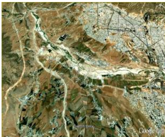
Figure 4. Building dispersion in Yasuj suburb in 2013

Whatever the participation rate and social awareness of the residents and owners is higher or the economic capability of the residents and citizens is higher and their comfort rate in city, neighbourhood, and residential units is higher, these can be an indication of the innermost development of the city. Unfortunately, this index is not true about Yasuj city and the local residents and owners rather than investing in the central part of the city, they lead the city growth toward their lands and cause the city grew in a sprawl form, in a way that a street in 1963 reached 18 kilometres in 2011. See Figure 4.