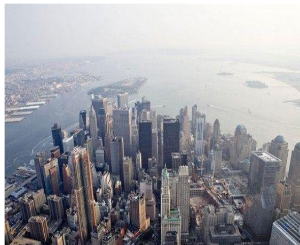
Figure 5. The New York City Center 2013 ( http://imgdl1.topnop.ir )