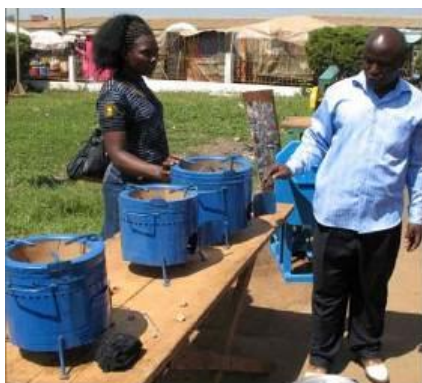
(c) Improved charcoal burners with ceramic linings Source (Nienhuys, 2010)