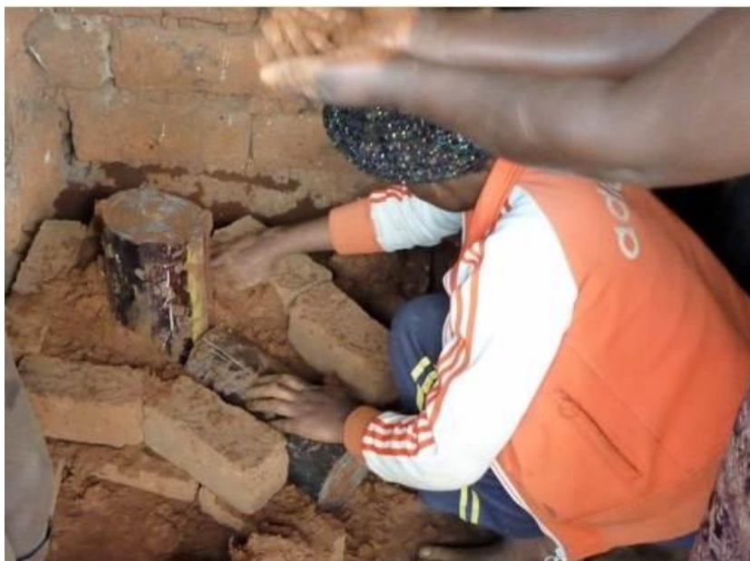
Figure 3. Initial stages-Building edges and combustion chambers