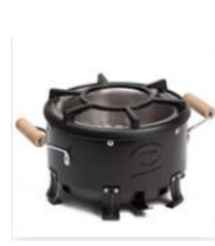
(e) CH-2200 Charcoal Source (Envirofit, 2014)