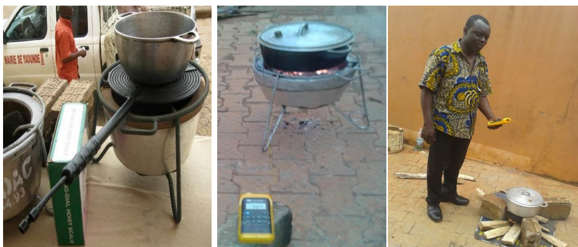
(g) ARPEDAC's improved stove under testing condition