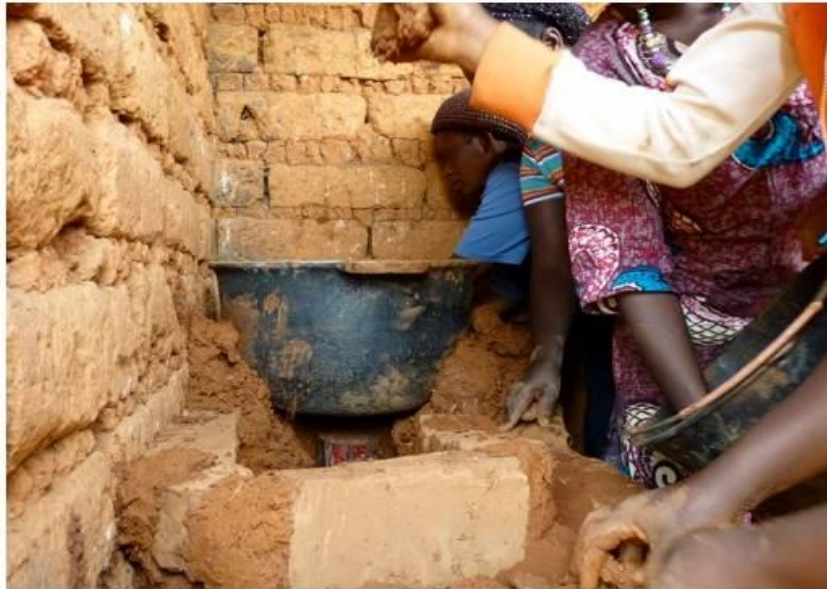
Figure 4. Placing pot to shape the size of the opening