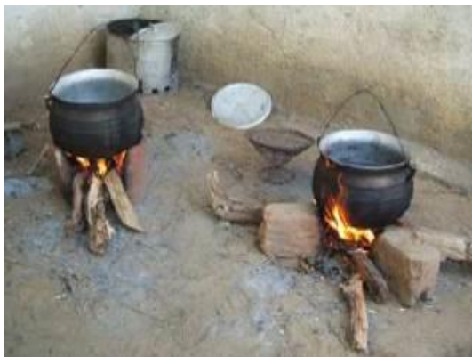
(a) 3-side firestone

traditional 3-stone fireside cook-stove and the results revealed that these stoves are energy efficient and can save up to about 60% of firewood and could last more than 5 years with little maintenance (ACREST, 2014). The University of Yaound é1 in Collaboration with ARPEDAC has carried further scientific investigations on ARPEDAC’s improved stove using the modified version of the well-known Water Boiling Test (WBT) in ARPEDAC’s laboratory (Figure 1: g), the kitchen indoor air quality (IAQ) checks and the flue gas analyser measures and logs ambient carbon monoxide (CO) and carbon dioxide (CO 2 ) levels were also investigated and compared with the conventional 3- stone fireside cook-stove (Mbieji, 2013). Also, there are other improved stoves being imported into Cameroon. However, there is no local scientific data to support their advantages over traditional 3-stones stove. Information about the amount of local energy saving and environmental benefits of improved cookstoves are scarce. Also, Envirofit is one of the major suppliers of clean stoves (e.g. Figure 1: d and e) in Cameroon (Calvert Foundation, 2013). It is estimated that 50 000 Envirofit stoves can prevent 570 000 tons of CO 2 from being emitted, save 700 000 of trees from being cut 5.5 million hours of women’s time spent in collected wood, $14 million reduced fuel consumption and 270 000 livelihoods improved (EFC, 2012). Other improved cookstoves available in Cameroon are depicted in Figure 1: b and c.