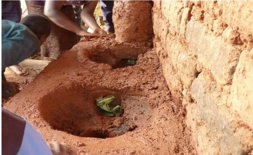
Figure 6. Smoothened stove