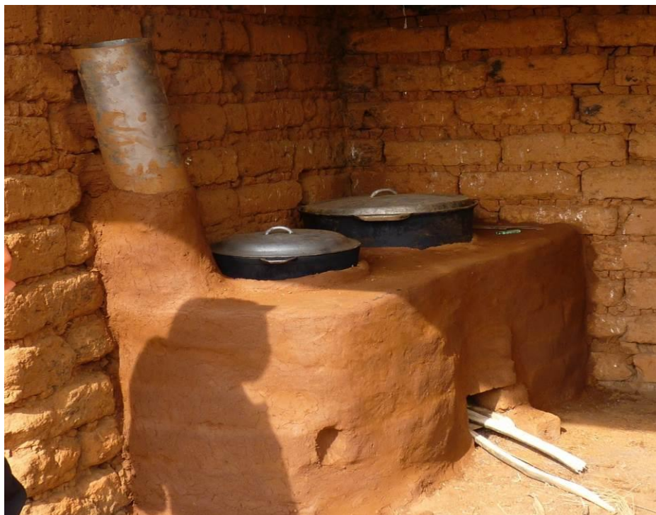
Figure 7. Complete stove ready for use