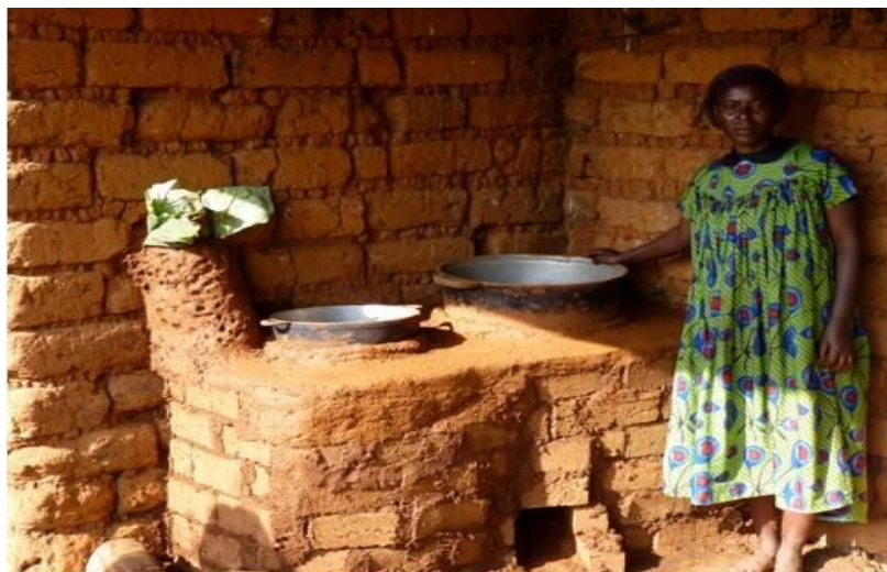
Figure 5. Complete stove depicting the chimney