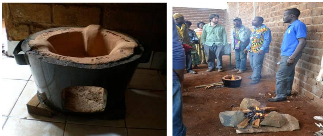
(f) ACREST's improved stove under testing condition