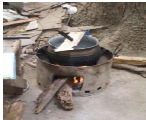
(b) Centrafricain improved stove