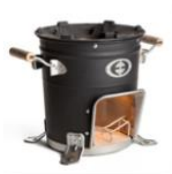
(d) M-5000 Wood Source (Envirofit, 2014)