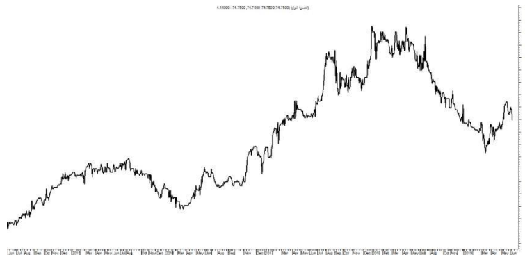
El-Nile Co. For Pharmaceuticals and Chemical Industries