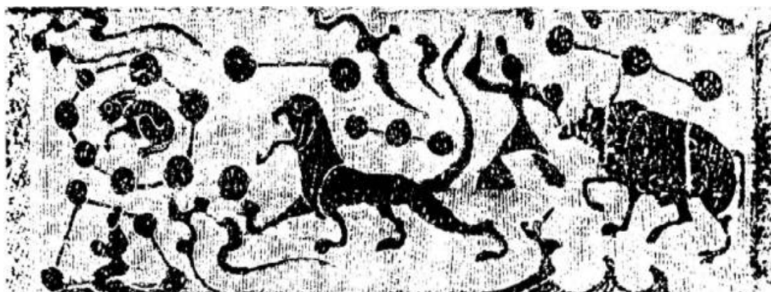
Figure 1. The Niulang and Zhinv in Nan yang, Henan Province, this is an astronomical portrait. The picture is from Chinese Ancient Astronomy in Pictures (中国古天文图录), Pannai (潘鼐), Shanghai Science and Technology Education Press, 2009, P.15, Figure1.26