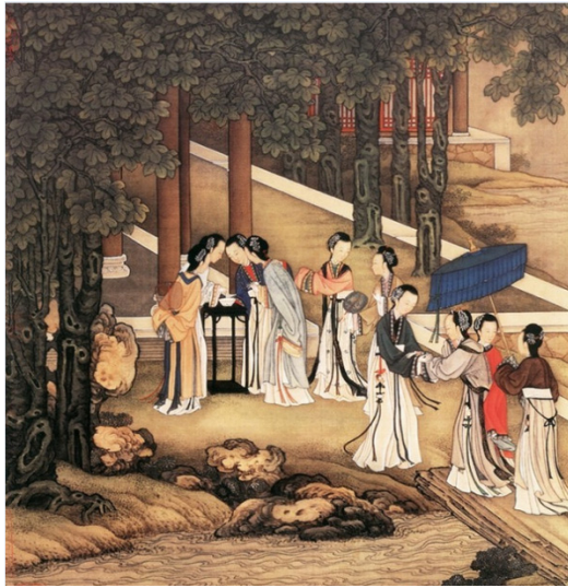
Figure 6. Qixi Tongyin Qiqiao 七月桐荫乞巧 drawn by Chen Mei (陈枚) in Qing Dynasty, Collection of Beijing Palace Museum