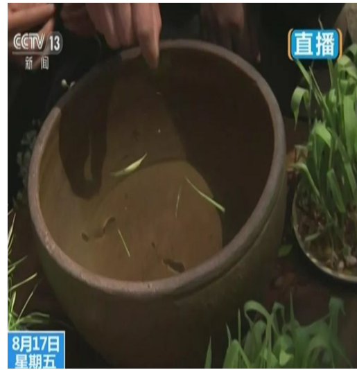
Figure 7 Buqiao activities in nowadays