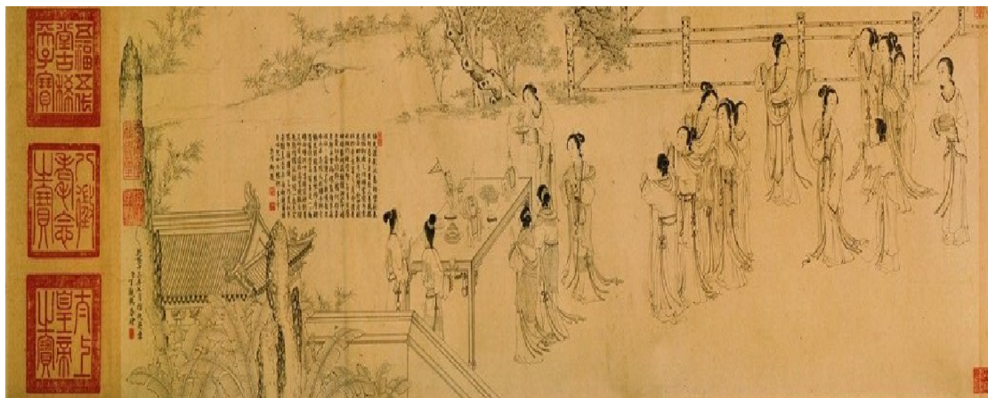
Figure 3. Part of Ding Guanpeng's (丁观鹏) The picture of begging dexterousness (乞巧图) in Qing Dynasty, Collection of Shanghai Museum

Wu Bing'an (乌丙安) pointed out that, the basic elements of the Qixi Festival custom can be divided into three aspects: ①Oral tradition: talking about the love story of Niulang and Zhinv; ②The activities of begging for dexterousness: young women perform divination by throwing flower needles, making Qiaoya (巧芽, clever buds), and forming spider webs. There is a competition of threading or embroidering for women; ③Sacrifice ceremony: people offer the sacrifice to Niulang and Zhinv, eavesdrop on their conversations and catch the tears of Zhinv. (Wu Bing'an, 2014, P.70) But in fact, the activities of celebrate the Qixi Festival has changed a lot over thousands of years. There are a lot of differences in the custom among provinces. The evidence can be found in the local chronicles.