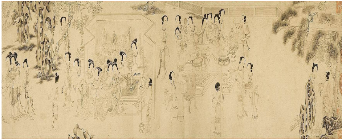
Figure 2. Part of Qiuying's (仇英) The picture of begging dexterousness (乞巧图) in Ming Dynasty, Collection of Taipei Palace Museum