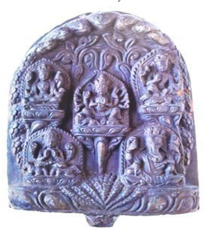
Sculpture of Devi Panchayan

The whole panel is guarded by the twisted and beautifully carved body of the seven serpents from top to bottom and right to left parts as well. The top part of the sculpture is nicely covered by a canopy of seven serpent hoods. Under it one can observe some beautiful carvings of plants. All the images of this panel look similar through the perspectives of carving skill and style, physical appearance and features as well. Goddess Kali appears to be seated at the center on the lotus base. Vishnu and Shiva are displayed on the right and left of the upper part, while Surya and Ganesh are depicted on the right and left corners on the lower part of the sculpture respectively.