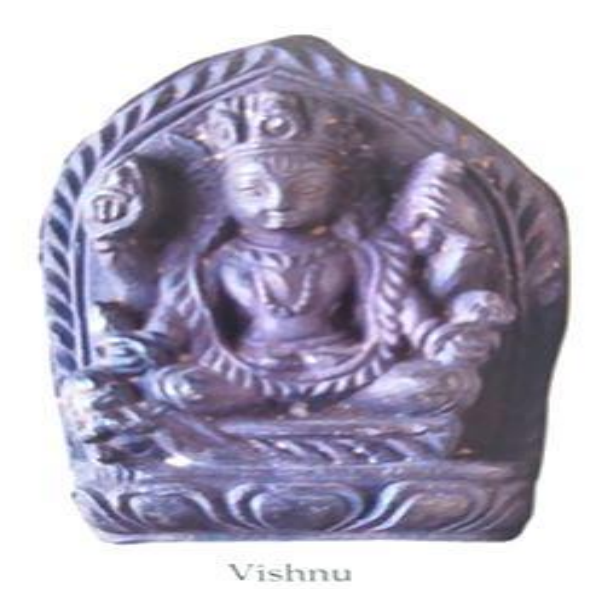
Sculpture of Vishnu depicted in the right side of upper part

The main deity Devi is depicted in the middle. Devi is also worshiped as one of the five deities in the Smarta tradition. She seats on the lion and demon. Her right leg is on the lion while the left one is on the demon. The seating posture of the goddess looks like the pralabapadasan . Devi has ten hands. Among the ten, one upper hand holds the skull and the other exposes a fearless gesture. Remaining others hold the attributes carried by the goddess. There is a simple nimbus with flame and decorated triangular shaped head crown on her head. Similarly, flower shape earrings on the ears, two layer simple necklace and long garland on the neck, tika on his forehead, bangles and armlets on the wrists and arms, and drapery on the lower part of the body and simple anklet on the ankle are the major ornaments and dresses seem to have been used on the figure of goddess.