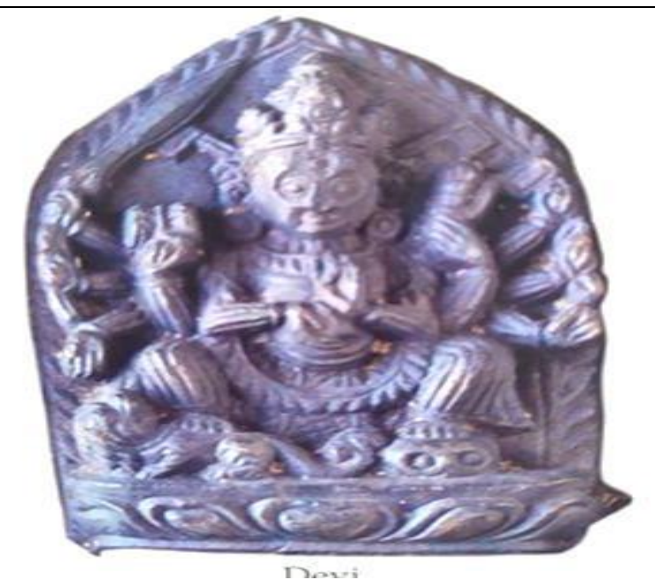
Sculpture of Goddess depicted in the middle

The main deity Devi is depicted in the middle. Devi is also worshiped as one of the five deities in the Smarta tradition. She seats on the lion and demon. Her right leg is on the lion while the left one is on the demon. The seating posture of the goddess looks like the pralabapadasan . Devi has ten hands. Among the ten, one upper hand holds the skull and the other exposes a fearless gesture. Remaining others hold the attributes carried by the goddess. There is a simple nimbus with flame and decorated triangular shaped head crown on her head. Similarly, flower shape earrings on the ears, two layer simple necklace and long garland on the neck, tika on his forehead, bangles and armlets on the wrists and arms, and drapery on the lower part of the body and simple anklet on the ankle are the major ornaments and dresses seem to have been used on the figure of goddess.