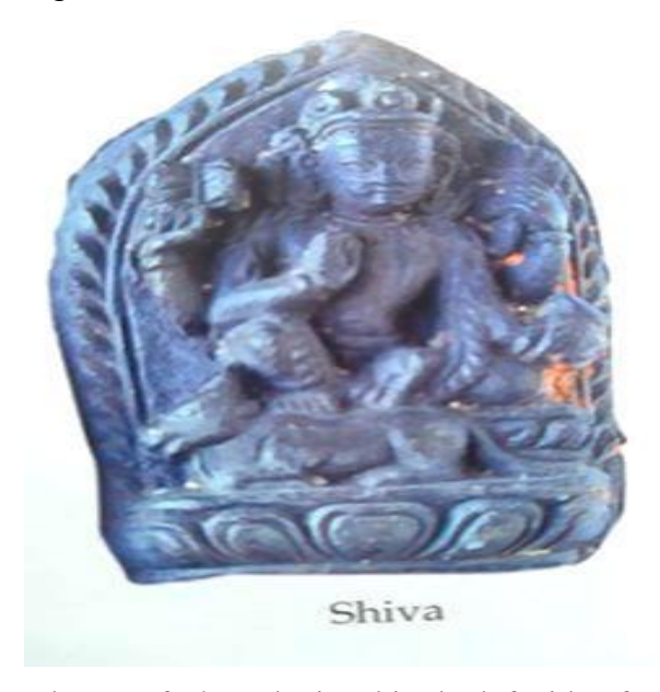
Sculpture of Shiva depicted in the left side of upper part

Viahnu is one of the five deities considered as equivalent aspects and means to realize Brahman in the Smarta tradition. There is an image of lord Vishnu on the right side of the upper part of the panel. The foremost Lord in the Shrutis is Vishnu. In this panel Vishnu sits on his mount Garuda. The seating posture of Vishnu is padmasan. He has four hands and holds different attributes which he carries generally. The right hands hold the Chakra i.e. flaming wheel and shankha i.e. conch whereas; the left hands are carrying gada i.e. mace and padma i.e. lotus. Decorated triangular crown on the head, flower shaped earrings on the ears, simple necklace and garland on the neck, tika on his forehead, and armlets on the arms, belt on the waist and drapery on the lower part of the body are the major ornaments and garments seemed to use on the figure of Vishnu.