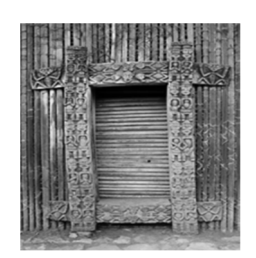
Figure 16: "bom'dya"