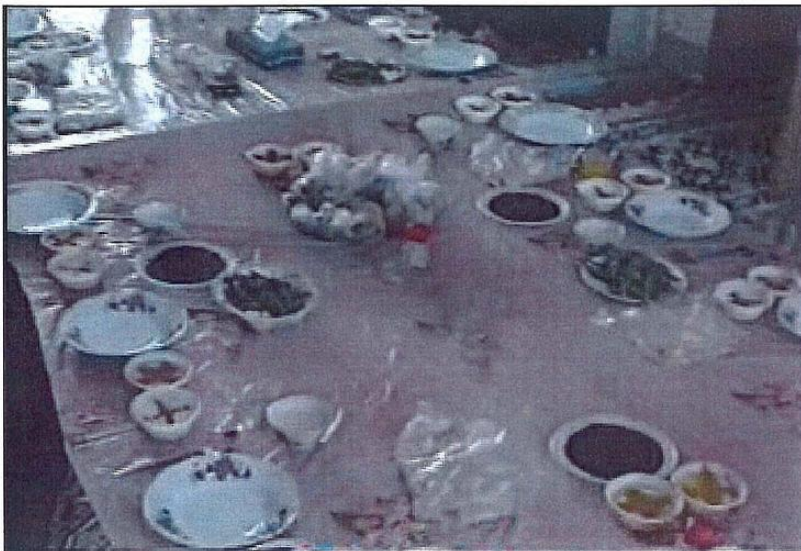
سفره حضرت ابوالفضل