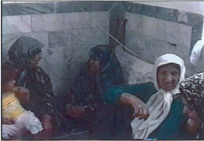
مصاحبه با خانم‌های کهنسال