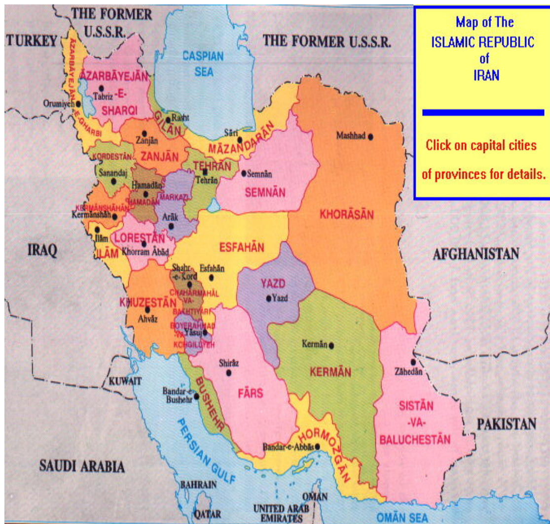
Figure 1. A comprehensive map of Iran

The following map shows the area of Garmsar which is a very small area and not many people live there. As it was explained, Ilika people live in this small area and what we studied about and discussed happened in this area.