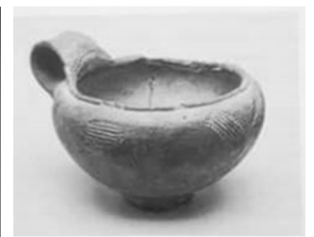
Figure 4: Terracotta plate (kei), clay, early 20th century, reign of King Forteto of the West, height 16 cm, diameter 16 cm, depth 18 cm, Bandjoun, cited by Knott and Bianca, 2005