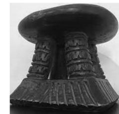
Figure 17: Bamileke Traditional Seat