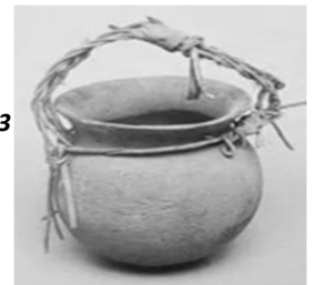
Figure 10: Terracotta pot (ta'a), terracotta, raffia, date unknown, height 37 cm, diameter 34 cm, Bandjoun, cited by Knott and Bianca, 2005