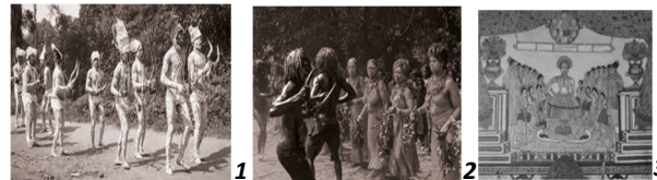
Figure 9: 1-2. The biannual initiation ceremony (secret organization) of the Baleng people 3. The fresco at the entrance to the traditional chiefdom, 4. Other body painting