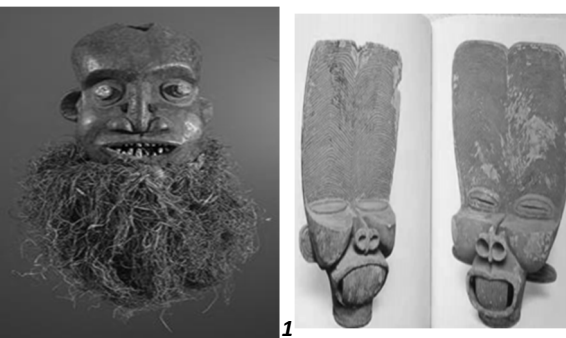
Figure 12: 1, Té mambu mask, Bamileke, 2, Bamendu-Cameroon mask called "Kacho" 3, mask called "Bacham"