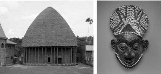
Figure 5: The Bandjoun chiefdom Figure 6: Helm mask, before 1880