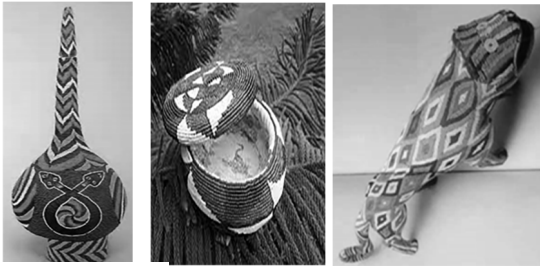
Figure 1: Beaded calabash Figure 2: Bamileke beaded animals