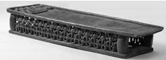
Figure 11: Kodya carved beds