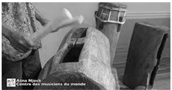
Figure 13: balafon