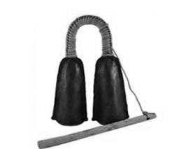
Figure 14: double bells or kwi' fo