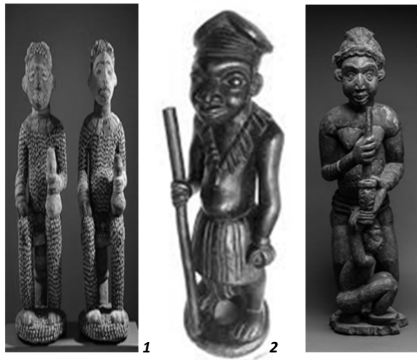
Figure 3: 1, Pair of large beaded figurines 2, famous Bamileke ebony sculpture 3, Bamileke wooden sculptures of woman and child