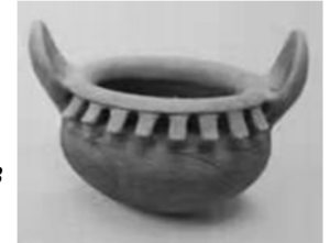
Figure 7: Clay soup plate (ngwang ndoeb abom), clay, height 17 cm, depth 10 cm, Kong Museum, Northwest Man Prairie, Noti, Bianca, 2005