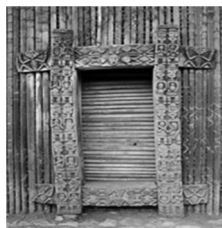
Figure 16: "bom'dya"