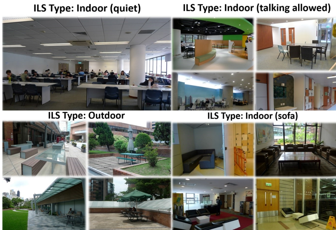
Figure 3. Derived ILS Types

Four ILS types were generated from 28 images. Applying the same classification to the 38 sites on campus resulted in: 2 Indoor (quiet), 9 Indoor (talking allowed), 20 Outdoor, and 7 Indoor (sofa) sites (Figure 3) (Table 1).