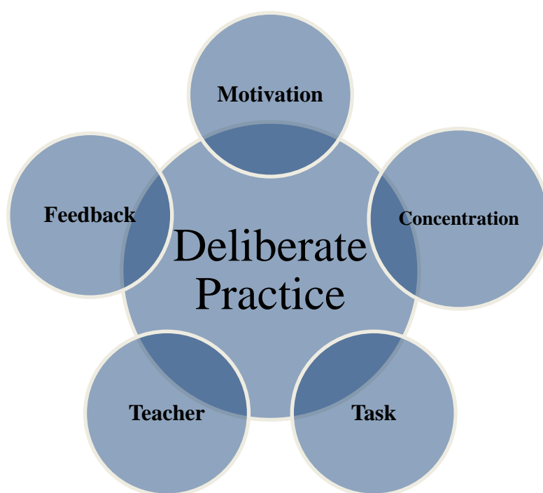
Figure 1. Elements of Deliberate Practice

finally give sufficient feedback based on the individual's performance. The tutor does not necessarily have to be a teacher or coach, as it can also be computer-based (Bransford et al., 2000). Ericsson et al. (1993) elaborate on the necessity of feedback by saying that with the absence of sufficient feedback, "efficient learning is impossible and improvement only minimal even for highly motivated subjects" (p.367). Research shows that the effective duration of deliberate practice is estimated at around one hour per day. On the basis of the literature reviewed above, I summarize the major elements for deliberate practice in the Figure 1 below.