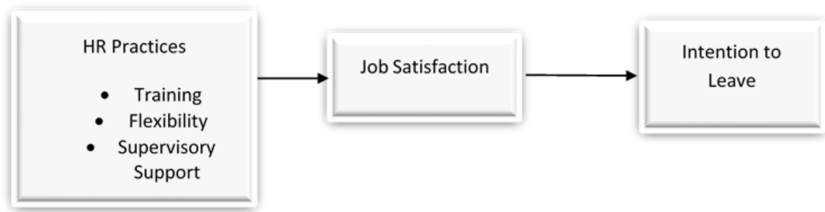
Figure 1. Conceptual Framework