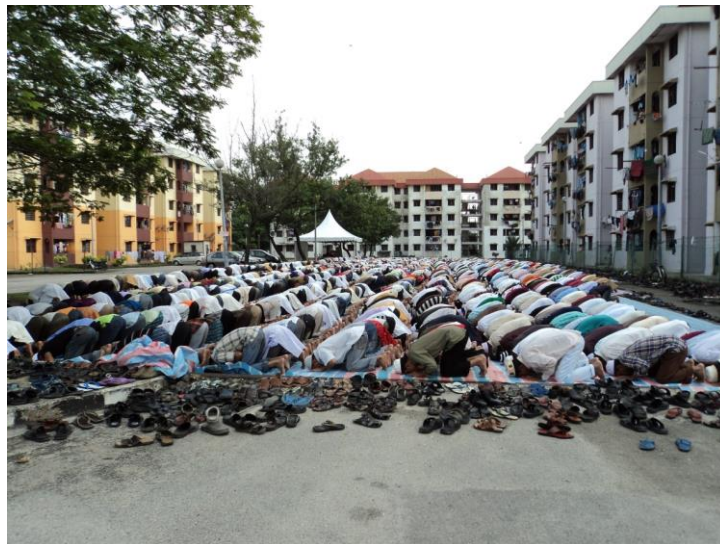
Figure 2. Eid-ul-Fitr prayer performed by Bangladeshi workers in research study area Port Klang Pangsapuri

Bangladeshi workers share Islamic cultural values with Malaysia and, thus, feel comfortable performing various social events. The location of the present research in Port Klang Pangsapuri is a very well-known place among Bangladeshi workers in Malaysia. This is the place where workers used to gather on important festivals such as Eid ul Fitr and Eid ul Adha. More than 5,000 Bangladeshi Muslim workers gather at each festival ( Eid ul Fitr and Eid ul Adha ) to perform prayers ( Salat ) performed by Bangladeshi workers at Port Klang Pangsapuri, in front of workers residential hostels, Block 21, Block 22, Block 23, and Block 25. There are also other social and religious activities performed by Bangladeshi temporary workers. Most activities are couched in Islamic culture and tradition, particularly in the time of the month of Ramadan (during fasting month), Maulidur Rasul , Nuzul Qur'an , etc., the Green River furniture factory Bangladeshi workers used to organize Islamic talks, Qur'anic recitation, and food distribution among workers. They also invite religious scholars to deliver speeches. Sometimes occasions like these the workers from other countries were also invited.