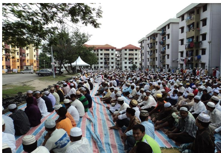
Figure 3. Eid-ul-Fitr prayer performed by Bangladeshi workers in research study area Port Klang Pangsapuri