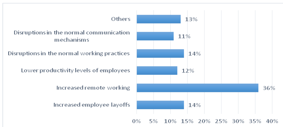
Figure 1. How COVID-19 has affected the field of human resource management

Concerning the ways through which COVID-19 has affected human resource management, the majority of respondents (36%) as presented in figure 1 indicated that the pandemic has increased remote working, 14% indicated that COVID-19 has increased employee layoffs and led to disruptions in the normal working practices respectively, whereas the least number of respondents (11%) indicated disruptions in the normal communication mechanisms. However, 13% of the respondents suggested opinions such as increased hiring of new employees, reduction in salaries of workers, deterioration in the individual wellbeing of employees, increase in agility, flexibility or creativity of HR professionals, and reduced commitment to different organizational activities while operating from home, among other opinions.