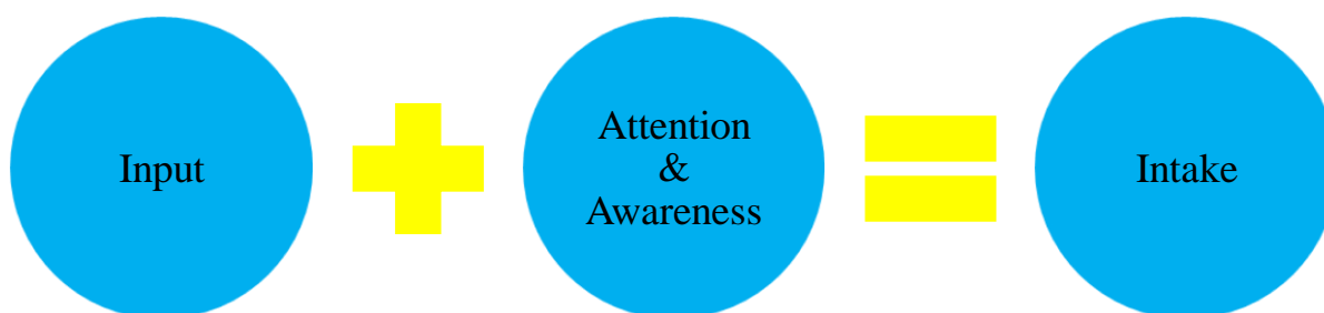
Figure 2: Noticing Hypothesis

Both explicit learning and implicit learning have their own strengths. Implicit learning is more suitable for “the learning of fuzzy patterns based on perceptual similarities and the detection of nonsalient covariance between variables” (Schmidt, 1995: 27). Explicit learning, on the other hand, is more suitable “when a domain contains rules that are based on logical relationships rather than perceptual similarities” (Schmidt, 1995: 27).