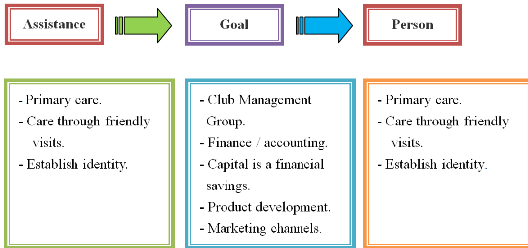
Figure 3. The strengthening of three goals for communities /networks