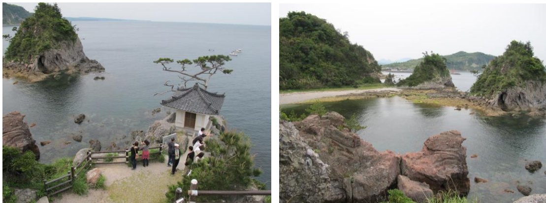
Figure 5. Himeshima

Himeshima Island: Located 6 kilometers to the North off the Imi Port of Kunisaki City, Himeshima is a small island of an area of 6.87 km 2 . The island was created due to volcanic eruptions that took place 200,000 years ago, and today, it is being promoted as a potential ‘geopark’ to attract tourists interested in natural landscapes. The ‘Kokuyoseki’ a special type of rock formed out of the intense eruptions, can be seen along the coast. Several rare types of rock strata, which can be seen just by walking along the island coast—are now being promoted as potential ‘geo-sites’, and the Himeshima island is being projected as a museum of geological landforms by the Oita Prefecture government. A beautiful local butterfly species, locally known as the Asagimadara (Chestnut Tiger or Parantica sita ) is another major tourist attraction.