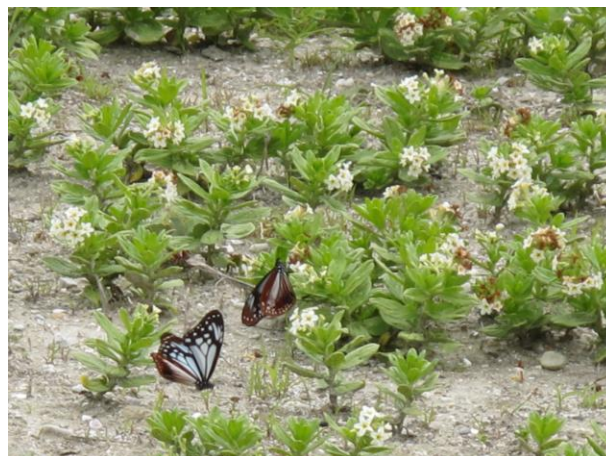
Figure 6. The Himeshima butterfly