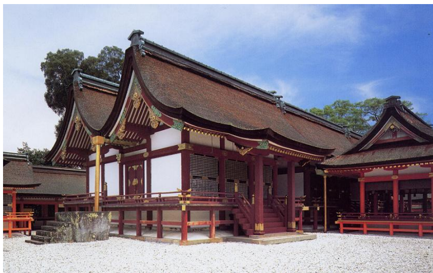
Figure 8. Usa Hachiman Shrine

Usa Jingu: The Usa Hachiman gu shrine, popularly known as the Usa Jingu, is among the