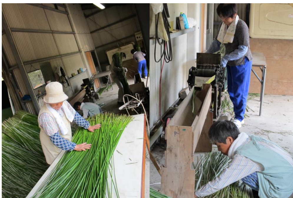
Figure 9. Shichitoui processing for Tatami mat weaving

The number of households engaging in this practice has dwindled to a mere 5. Recently there are a number of efforts to revive this tradition and the Kunisaki Shichitoui Promotion Network was founded in 2010. The shichitoui grass mat is a very durable product, and it has numerous advantages over conventional grass mats: such as the fact that asthma patients who are generally allergic to straw mats can use this product freely, and the mat is more fire resistant compared to conventional grass mats, making it a safer material for homes. However, the plantation, sprouting, collecting and weaving of shichitoui requires human hands all the time, as the grass is thicker and longer than other types of grass used for weaving, it cannot be cut using conventional cutting machines. Today, all five households weaving this type of mat do so by hand, making it an important cultural practice (Figure 10). When we consider the various properties of the shichitoui, we can add that the practice can be a viable livelihood option at a small scale due to its advantage over other types of weaving grass, and is likely to promote a more environment friendly way of mat-weaving.