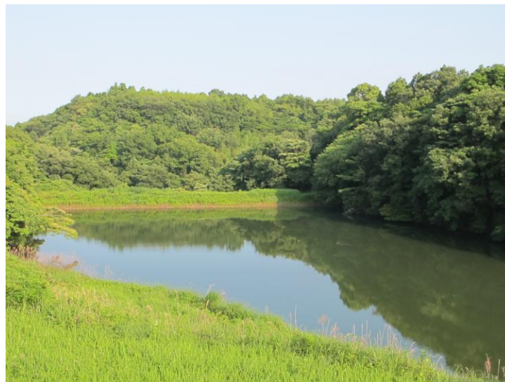
Figure 3. A typical tameike reservoir

Tameike Reservoirs: Tameike in Japan has a very long history, the oldest such ponds were dated back to the Kofun Period (i.e. 300-700 AD) (Uchida, 2003), but several researchers have pointed out the possibility that tameike systems were already developed during transition period between Yayoi and Kofun eras (250-538), when wet-rice cultivation arrived in Japan. This shows that the origin of the tameike system dates back to the spread of wet rice cultivation itself. Tameike reservoirs formed a central part of rice paddy cultivation, flood control and also sustenance of indigenous species in pre-modern Japan. However, like many other forms of indigenous knowledge systems, the tameike system began to decline after modernization and economic growth became the main agenda of the country, in the post Meiji Restoration (1867) period. The peak of the decline arrived during the bubble growth period: a Ministry of Agriculture Forestry and Fisheries (MAFF) survey clarified a picture of drastic decline in the numbers between 1979 and 1989 (Uchida, 2003). In the case of Kunisaki, the total number of tameikes stands at nearly 2000 now, which is nearly 30% of the peak period, where a total of over 6000 such ponds existed.