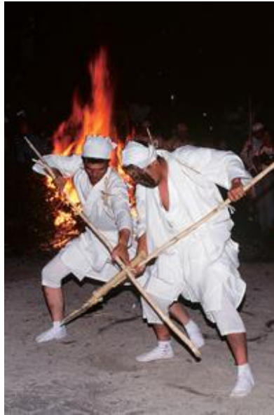
Figure 7. Kebesu Odori festival

Apart from these rituals, which are now becoming increasingly rarer and difficult to observe, a number of cultural relics are readily found by the visitor in the Kunisaki landscape. Many of the 69000 legendary stone carvings remain, with other sculptures and arts created in subsequent years. A special feature is the presence of towers showing pilgrimage routes, position of temples and the cosmo-vision of ancient societies.