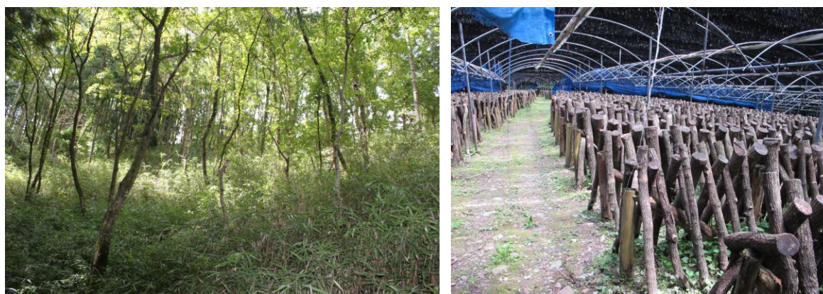
Figure 4. Kunugi forest and logs for shiitake mushroom farming