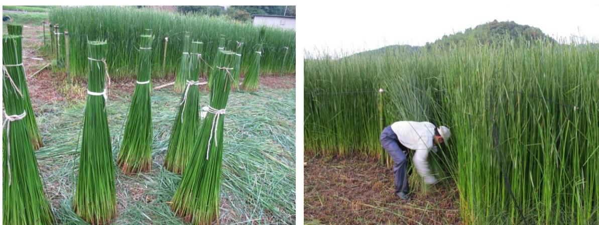
Figure 2. Shichitoui agriculture

Though Kunisaki today is a rather secluded place, a ‘peripheral’ area threatened by advanced