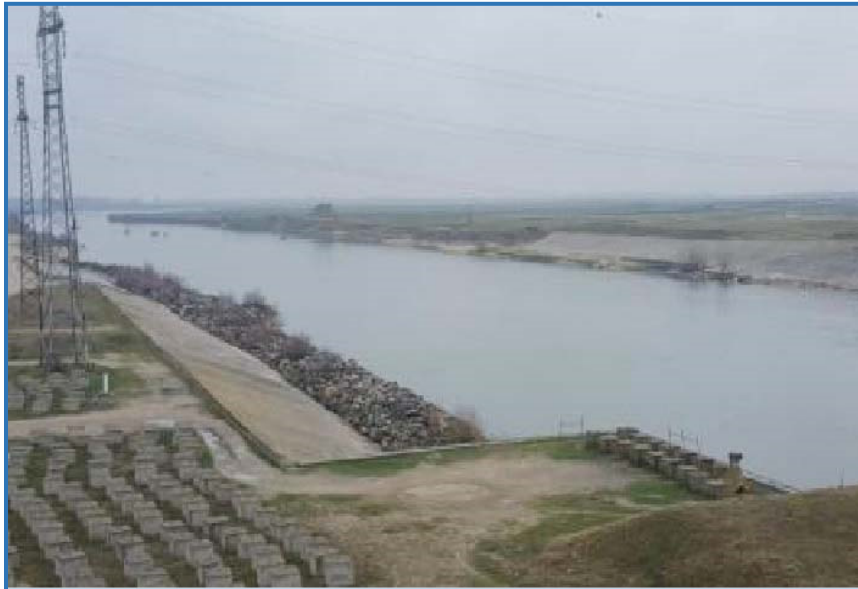
Figure 3. River Olt entry in locality Giuvarasti

The studied part Olt River basin the only river crossing the region under study at its eastern part and part of the irrigation system Sadova-Corabia it is crossed by a network of channels of supply and water discharge (Figure 3).