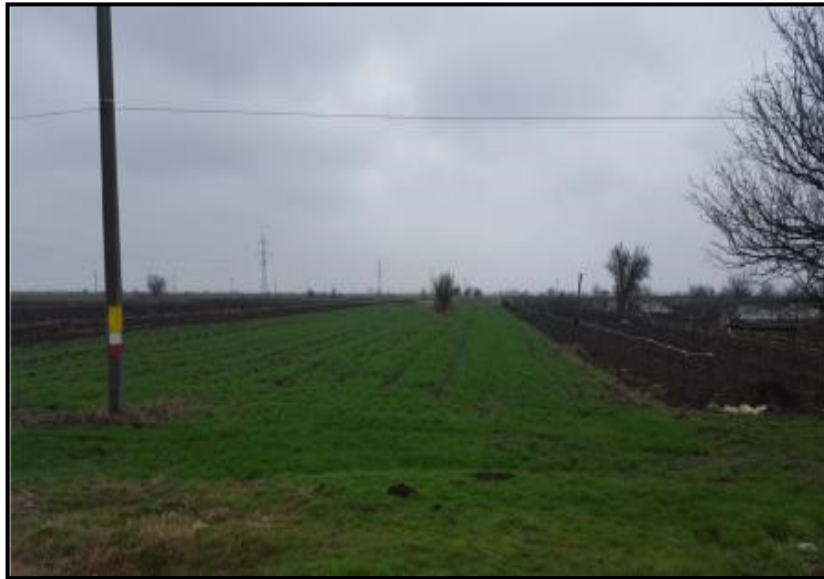
Figure 1. Lower terrace Danube the Giuvarasti

On the territory commune Giuvarasti floodability processes it occurs only in Olt floodplain and Valley Ursii. In periods of rainfall occur bank erosion and deepening of the riverbed valley (Figure 2).