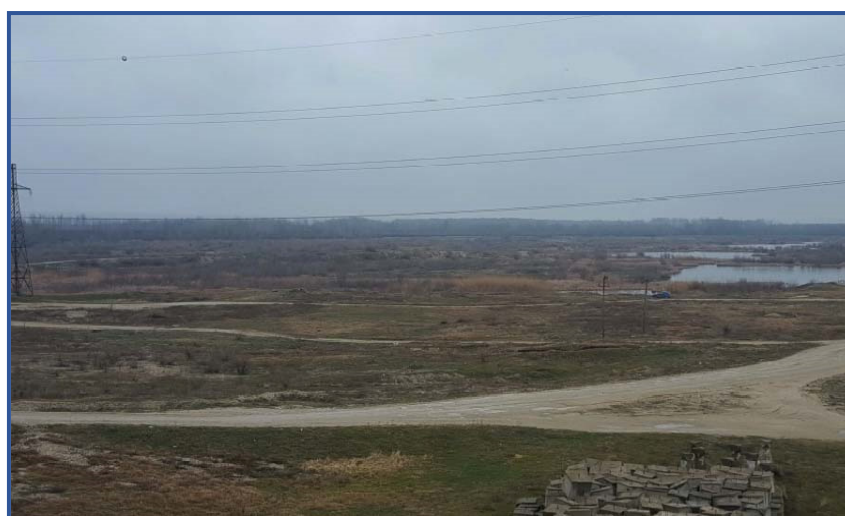
Figure 2. Olt floodplain the Giuvarasti

Quaternary form the cover surface (covering levantine) in which the studied area meet two specific lithological complex main forms of relief, namely complex loess-like characteristic Romanati Plain and complex alluvial characteristic for Olt floodplain.