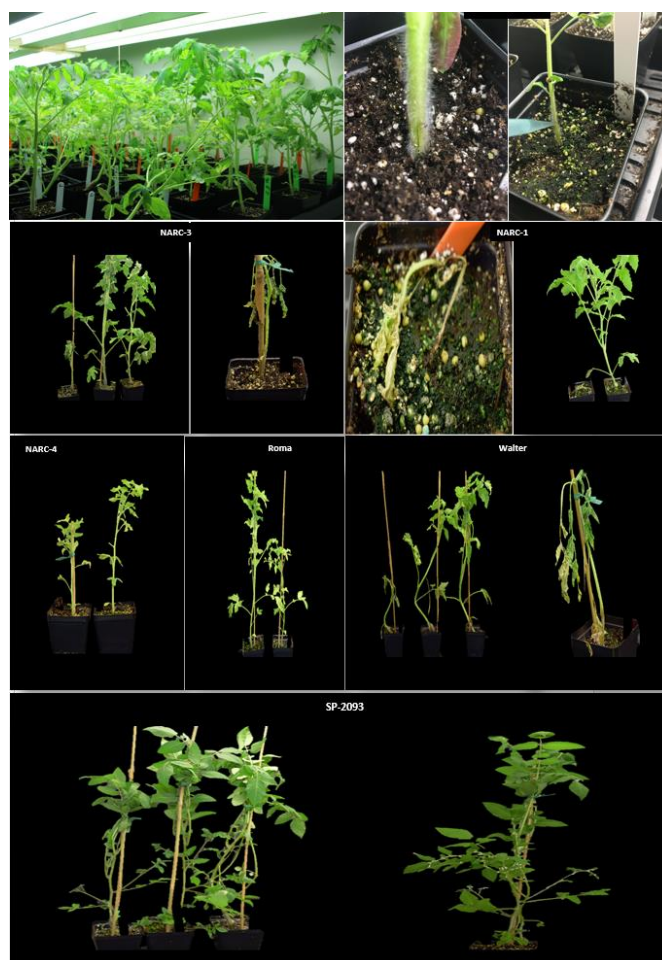
Figure 3. Fusarium equiseti inoculation and symptom development on different tomato varieties screened for resistance

A total of thirteen tomato varieties (hybrid, heirloom and wild) were screened for resistance against the emerging wilt pathogen Fusarium equiseti causing wilt of tomato in Khyber-Pakhtunkhwa. The susceptible varieties showed typical wilt symptoms while the resistant varieties remained diseased free (Figure 3).