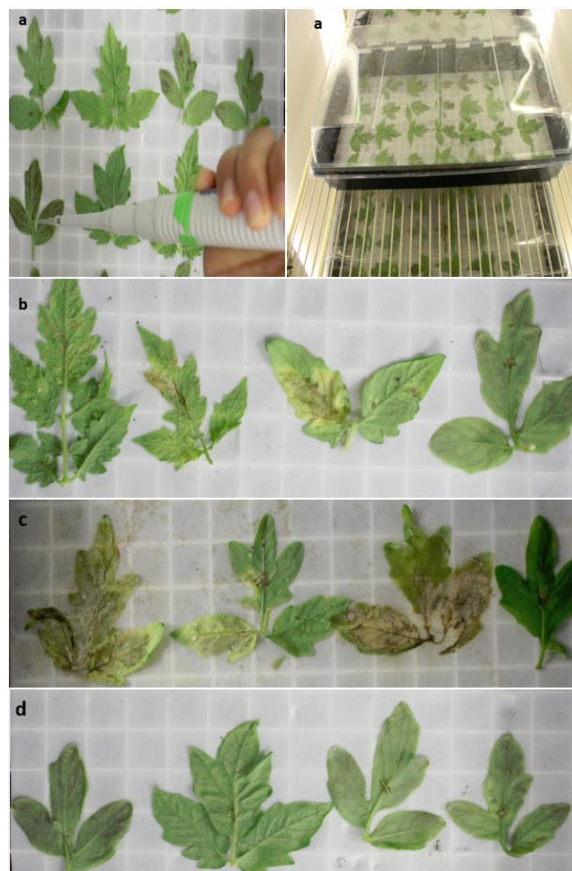
Figure 2. Pathogenicity of Fusarium species isolates on detached tomato leaves. (a) Inoculation of leaves and incubation. (b) F. equiseti isolate =Pak-6. (c) F. equiseti isolate =Pak-1 (d) leaves inoculated with nonpathogenic Isolates

The isolates tested for pathogenicity showed differential responses. The pathogenic isolates ( F. equiseti ) resulted in substantial lesion development on detached tomato leaves, while the nonpathogenic isolates did not produce any lesion (Figure 2 d). The isolates Pak-6 and Pak-1 showed severe reaction and were highly virulent (Figure 2 b, c). Pathogenicity assay showed that out of 20 isolates of F. equiseti two isolates i.e. Pak-1 and Pak -6 from district Swat and district Mansehra were highly virulent on tomato leaves whereas the other 18 isolates were either moderate or weak pathogens. The possible infestation of tomato plantation by other Fusarium species may be due to the fact that Fusarium species can survive for years in soil in the form of chlamydospores or in plant debris in the absence of their host (Sutton, 1982, Leplat et al., 2013, Pereyra et al., 2004).