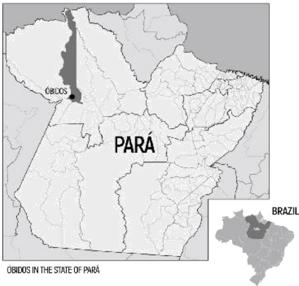
Figure 1. Map of the region where sampling was undertaken.