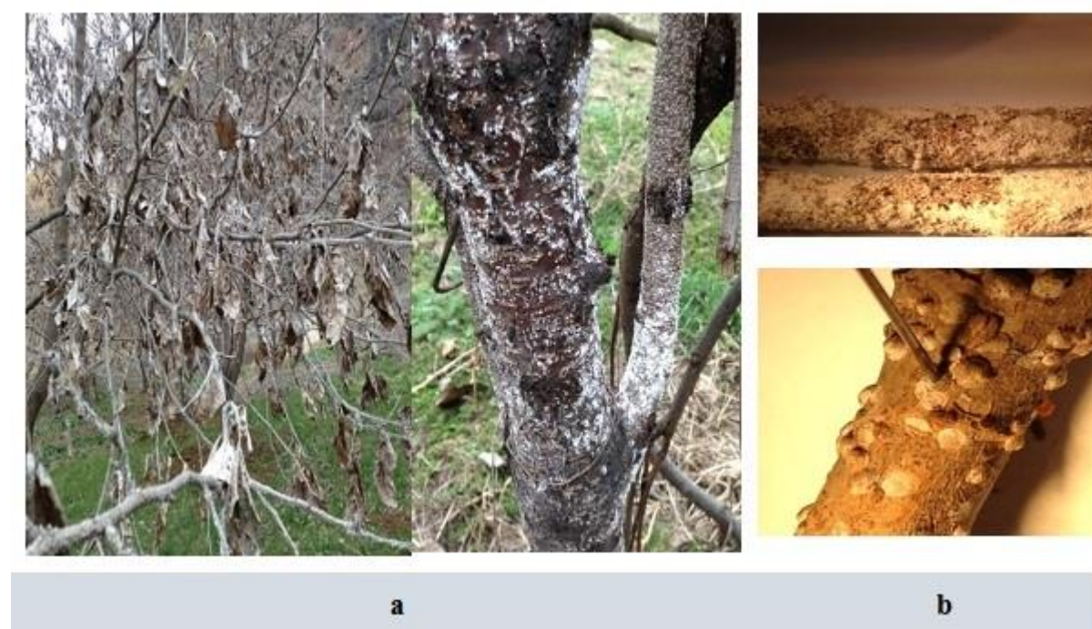
Figure 1. Land view of trees damaged with Pseudaulacaspis pentagona (a), naturally infested mulberry twigs with Pseudaulacaspis pentagona (b)

Naturally infested (included P. pentagona ) mulberry twigs ( Morus alba ) observed in Erzurum, Turkey (Figure 1a). Mulberry and P. pentagona were used as host plant and harmful insect in this study, respectively (Figure 1b).