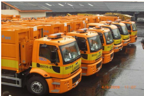
Photo 1 PSP Waste trucks in partnership with LAWMA Photo 2 scavenger at Olushosun landfill