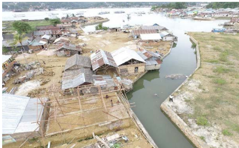
Figure 3. The Slums Along The River

The slums is a problem faced by the Government of Kendari city, especially the area of housing and settlements located on the banks of the river, which generally develops in a linear manner or follow the flow of the river with the construction of buildings house low-quality and not supported with the basic infrastructure of settlements such as, roads, sanitation and access to drinking water.