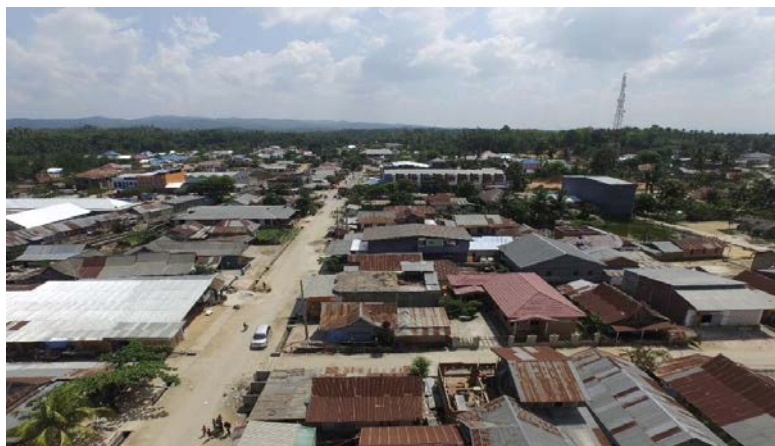
Figure 2. Slum City Centre

The housing and slum emerging in the downtown area a result of the quality of the economy that is getting low and the density of settlements as well as the rapid rate of population growth due to factors of urbanization. This factor occurs due to the use of empty land in the center of the city in the wake of the absence of regulation and planning. As the impact of poverty in rural areas, making urbanization that impact negatively on the development of the City, namely the increasing demand for the provision of facilities and infrastructure of the settlements which eventually lead to the slums, it is because of the imbalance between the rate of increase in population with the rate of construction of residential facilities. The imbalance between the needs with the provision of infrastructure facilities and housing with a request will impact on the quality of infrastructures such as the area of the house where lived below 6 m 2 /person and directly not or have less access to other public services such as clean water, sanitation, and others.