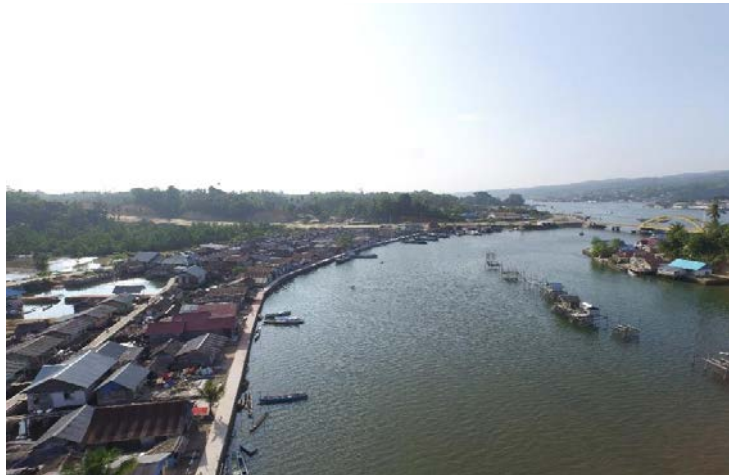
Figure 3. The Slums of The Coastal Area

The growth of slums in the coastal area don't regardless of the lack of supervision coupled with the lack of the knowledge society patterns of land use based spatial plan of the city of Kendari so that people doing construction by erecting shacks wild in the area which resulted in the settlement environment that is dense and irregular.