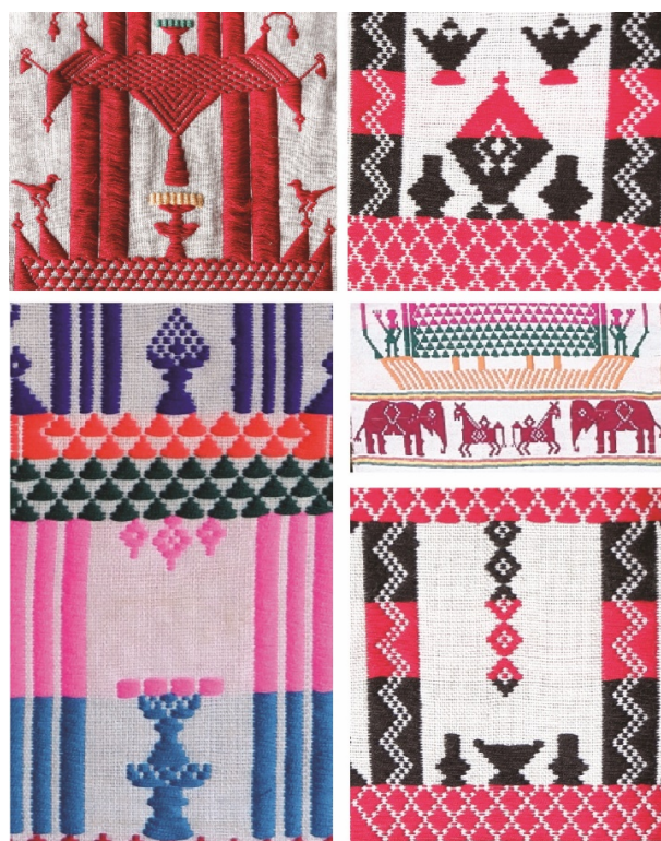
Figure 5. Utensil patterns

At present, weavers are becoming more creative by adding modern patterns, i.e. , adding a Thai flag pattern to the top of the castle. Each Tung is unique to each weaver. Increasing or decreasing the details of the pattern is therefore based on the creative ideas and imaginations of each weaver. They can identify where each Tung comes from based on the pattern, whether they belong to themselves or are those of others because they are all unique because of the pattern placement, cotton line counting, and detailed collection of different stripes.