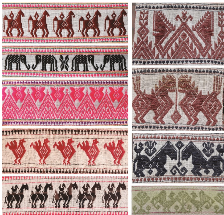
Figure 2. Animal patterns

In the past, TLEG used elephants and horses for construction and transportation. The patterns showing butterflies reflect beauty and natural fertility. For the patterns of mythical animals, the Hasadilink bird is a combination between a bird and an elephant, which is Nok Nguang Nga (a bird having the tusks and the trunk of an elephant), which refers to heaven because this bird/elephant hybrid would bring the souls of dead people to Trāyastriṃśā (the heaven in Sanskrit representing serenity and sacredness). The Naga (a giant serpent) represents the ecological balance of nature and also the worship of ancestral spirits in order to bring fertility. The Lion represents the power of the Himmapan forest (a fantasy forest) and heaven. In addition, there are the patterns of small humans found on the Tung that represent the servants bringing people to heaven.