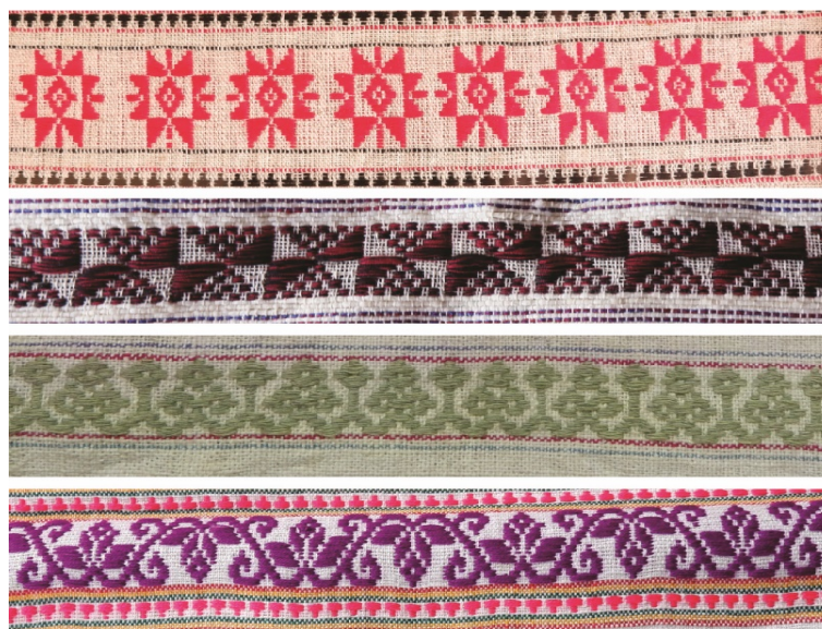
Figure 3. Plant Patterns

In addition, there is a pattern that is used for decorating Tai Lue Tung and the paper Tung of the Tai Yuan ethnic groups, which is called the ‘Ka Kok’ pattern, which signifies fame and honours. It is based on the rectangular shape of ‘Ka Kok’, a floating water plant that TLEG feed to ducks, representing the fertility in nature. The pattern of ‘Dok Chan’ means an idealistic flower that is found in several cultures, looking like a star (‘Chalaeo’ or ‘Ta Laeo’), which is a basketry item that TLEG use for expelling ghosts or evil spirits. The pattern of ‘Dok Chan Paet Klip’ (eight-petal flowers) symbolises the eight directions, namely, north, south, east, west, northeast, southeast, northwest and southwest. The ‘Dao Phaedan’ pattern comprises a round centre with 8, 18 or 36 petals, depending on the Tung weavers. Tai Yuan Ethnic Groups often call it the ‘Kaeo Ching Duang’ pattern, or the ‘Dok Khwak Noi’ (small) pattern and ‘Dok Khwak Yai’ (large) pattern depending on the size, similar to the ‘Laem Hit’ pattern. All of the aforementioned patterns are used for decorating the ends of Tung for aesthetics purposes. The ‘Mak Kha Naet’ pattern, which looks like a pineapple, is also used for decorating the top of a castle for uniqueness and aesthetics. TLEG have weaving methods and patterns that reflect lifestyles that are bound to the environment. Natural resources combine with the local identity and imagination of the weavers.