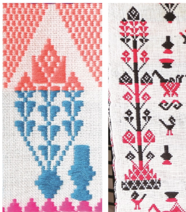
Figure 4. Ton Dok pattern