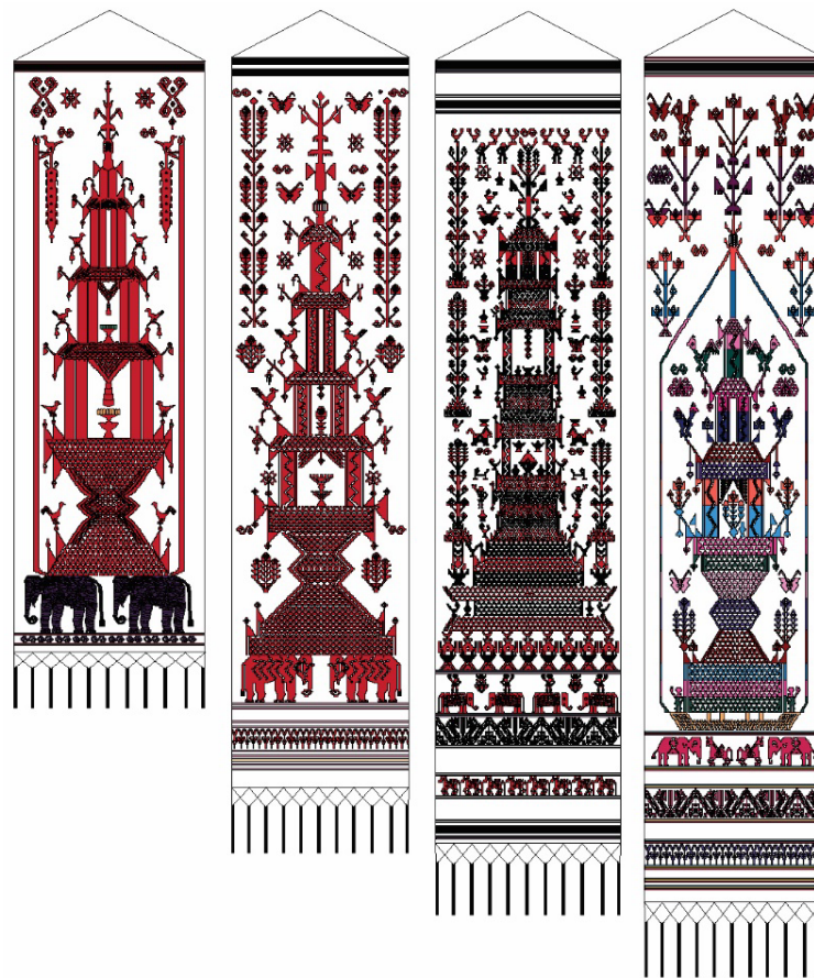
Figure 6. Tung of the Tai Lue from various weavers that have castle patterns are the main symbol