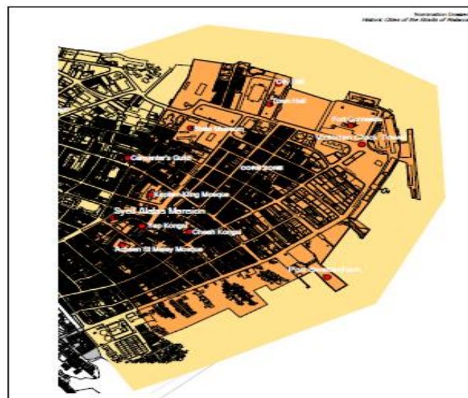
Figure 3. Core Zone of George Town