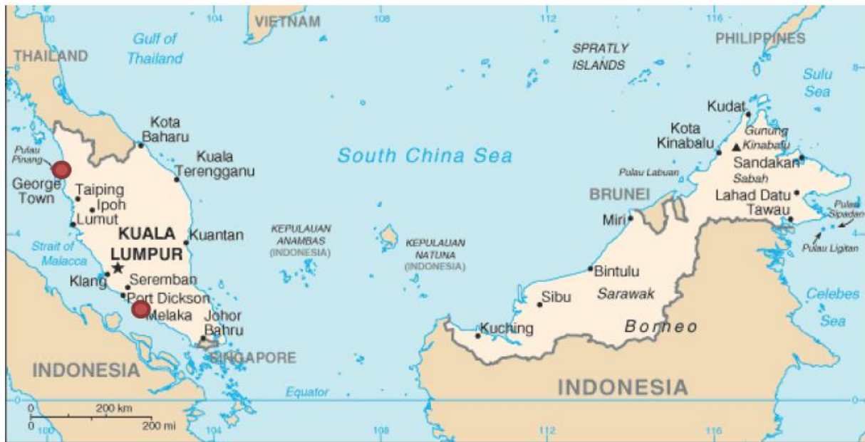
Figure 1. Location of Melaka and George Town

Literally, both of historic cities display testimony to a living multi-cultural heritage as well as custom of Asia, where the numerous religion and culture met and exist together. They reflected the coming together of cultural aspects from the Malay Archipelago, India, China and also with those of Europe, to create a unique architecture, townscape as well as culture (Siti Norlizaiha & Izzamir, 2011). Thus, both cities have fulfilled some of the criteria set by UNESCO (2018) with regards to its Outstanding Universal Value and further details are as follows: