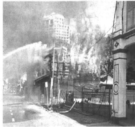
Morning fire: Firemen putting out the fire at Jalan Parameswara in Malacca.

It is learned that the buildings were valued at more than RM500,000 per unit.