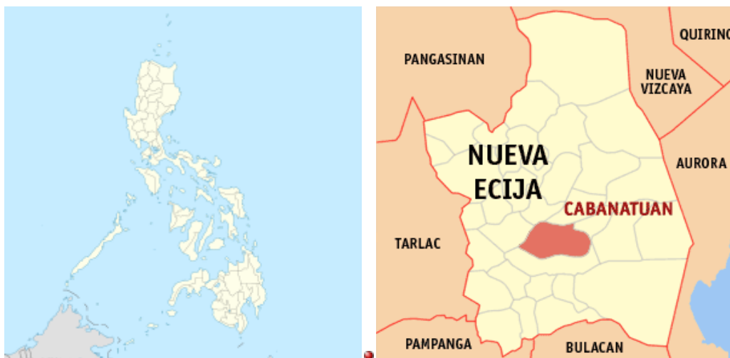
Figure 3. Map of the Philippines and Nueva Ecija showing the study locale