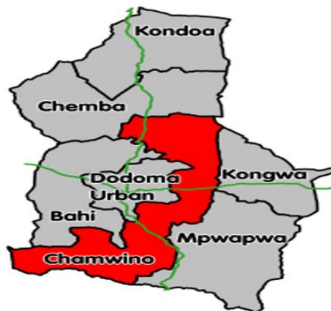
Figure 1. Geographical location of Dodoma Urban

The area was selected since recently it has experienced an increase of social, economic, and political interactions following the government decided to transfer the government business from Dar Es Salaam to Dodoma. As a result, the population of Dodoma urban has increased manifold causing mushrooming of business, transportation, and social activities in the area. This indicates that perhaps the area is more vulnerable to COVID-19.