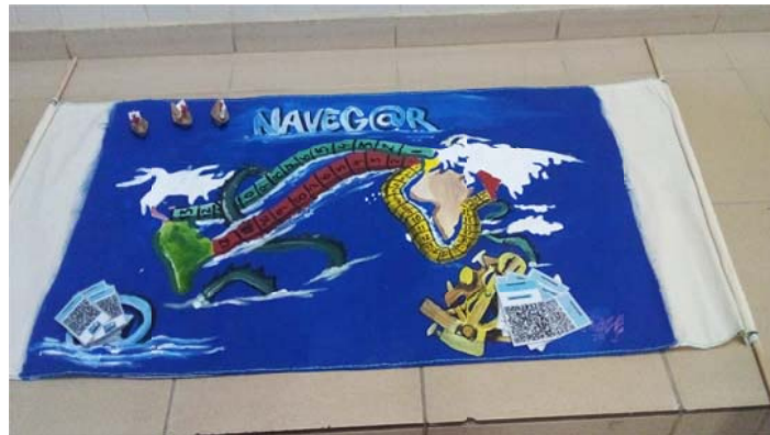
Figure 1. Board, cards and caravels.

In addition, QR Code cards were created, created on the Canva website, printed on bond paper, and laminated, containing the questions that should be answered and the number of houses to advance represented by the image of caravels below the questions on the cards. The game's pins were developed in the Caravels format, using folding on brown paper, bond paper for the flags, and a toothpick to make the pole.