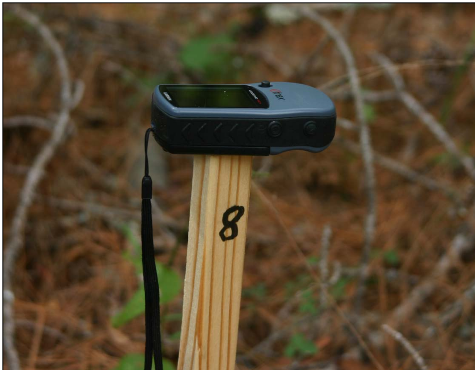
Figure 8. Placing a GPS unit above a wooden stake to collect the average waypoint for location number eight