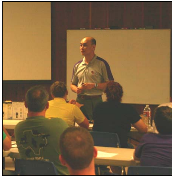
Figure 2. Informing students of their involvement in a GPS study in the central classroom