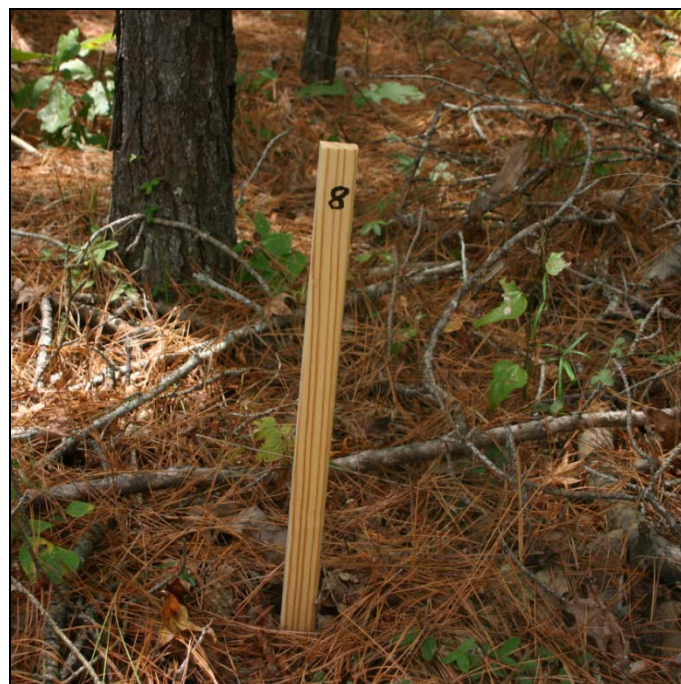
Figure 6. Wooden stake identifying faculty chosen waypoint location number eight