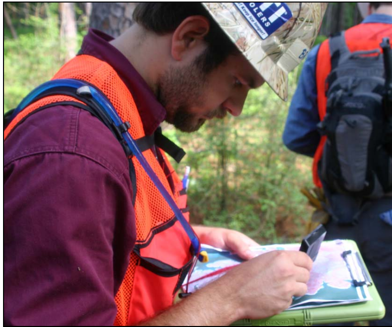
Figure 7. Students navigating to each faculty chosen location with a map and compass

Once the initial hands-on instruction on the island was completed, students were taken to the field to collect the average waypoint of 11 faculty chosen spatial locations within the adjacent Angelina National Forest that were identified with a labelled stake (Figure 6). The students navigated to each identified waypoint in the field using compass and pacing (Figure 7) and collected the average waypoint for each of the 11 locations using the Garmin eTrex Legend HCx and the Garmin eTrex 30 GPS units while placing each GPS unit directly above each stakes location (Figure 8). In the field the students collected data independently to increase confidence and to validate their GPS knowledge. Faculty members travelled with the students to provide further instruction as needed.