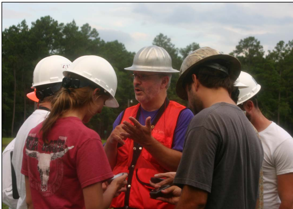
Figure 4. Interactive faculty GPS instruction on the island prior to going to the field

Once the GPS units were configured to be WAAS enabled, the students were then taken to the island in the central portion of PWCC to receive one-on-one faculty instruction on how to collect an average waypoint (Figure 4). An average waypoint captures the GPS derived real-world coordinates representing the actual location of each GPS unit by taking the average of multiple waypoints recorded per spatial location to increase the accuracy of the recorded spatial location. Students were instructed via hands-on methodology how to record the average waypoint per GPS unit: for the Gamin eTrex Legend HCx it was the average of 30 individual positions while for the Garmin eTrex 30 it was the resultant average waypoint recorded when the Garmin eTrex 30 GPS unit sample confidence level reached 100 percent (Figures 5a-b). Students were also instructed how to collect their waypoint location data in the Universal Transverse Mercator (UTM) coordinate system, the typical coordinate system required by most natural resource based entities.