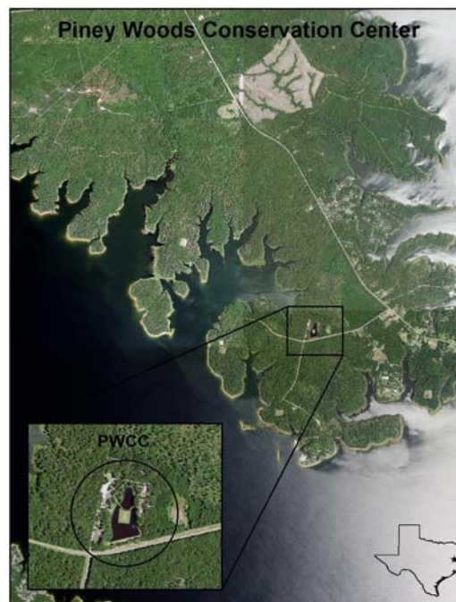
Figure 1. Location of the Piney Woods Conservation Center (PWCC) on the shores of Sam Rayburn Reservoir adjacent to the Angelina National Forest

The forestry field station is located at the Piney Woods Conservation Center (PWCC), a residential conservation center located adjacent to Angelina National Forest on the shores of Sam Rayburn Reservoir approximately 15 miles south of Broaddus, Texas (Figure 1). Constructed in 1985 for Stephen F. Austin State University's College of Forestry, the facility is used year round by the university, private and professional groups.