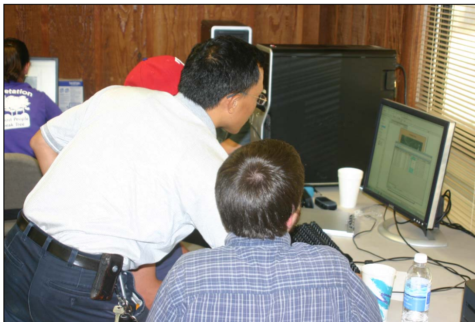
Figure 9. Interactive faculty instruction showing students how to download their GPS data to a PC after returning from the field

A visual assessment of student collected average waypoints at all 11 identified locations, which was displayed on screen to all the students in the central classroom to validate their