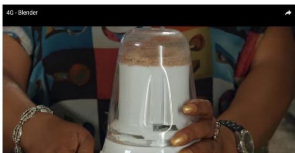
Figure 5 The mortar/pestle and the blender