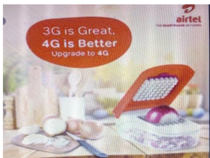
Figure 7 The Chopping Board and the Multipurpose Chopper

makes cooking faster and less stressful. The chopping board represents the 3G while the multipurpose chopper represents the 4G Airtel.