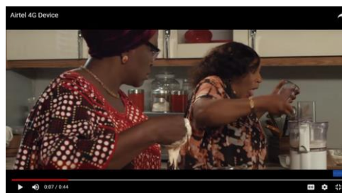
Figure 6 Using the hand to mix and using the electric mixer