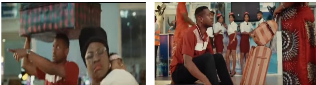
Figure 1 The portmanteau and the four-wheeled suitcase

figure1. The four-wheeled requires less effort to wheel and each wheel can turn 360 degrees to change direction. Even when packed to capacity they are easy to pull along. The commercial shows luggage as a crucial part of ones travel so every traveller needs a traveller's bag that is sturdy, reliable and that will last through many flights, train rides and transfers through pavement ( https://www.adsoftheworld.com ).