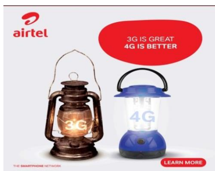
Figure 8 The Lantern and the Recharge Lamps

Another comparison between 3G and 4G is done through the lantern and the recharge lamp. The lantern commonly known as 'bush lamp' is what is used where there is no electricity or when there is electricity shortage. It is portable, reliable for outdoors and uses a wick that lights at the top and connects into a tank that contains kerosene. The light at the tip is protected by a globe that encloses the wick. The lantern emits smoke that causes soot making the lamp dirty and can affect the eyes. It is fragile and needs regular cleaning. The recharge lamp on the other hand, needs just solar energy for charging and shines brighter than the lantern. The recharge lamp is replacing the lantern kerosene lamps because it is brighter, cleaner, easier to handle and cheaper to maintain. The comparison between the lantern (3G) and the recharge lamp (4G) is convincing enough for the consumers to go for the Airtel 4G products. The advertising message reads '#3GIsGreat4GIsBetter'.