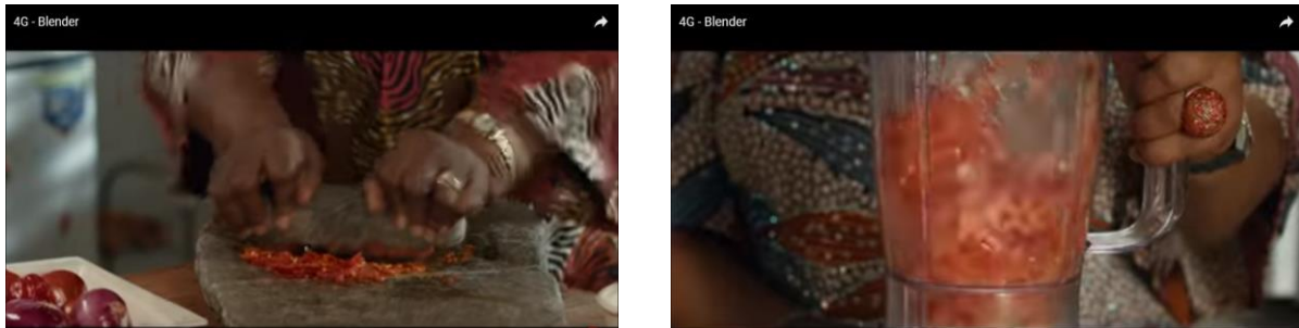
Figure 3 The grinding stone and the blender

addition to the use of much energy and strain, it is disadvantageous in using the stone in that if the pepper touches the grinder's hand it leaves a burning sensation.